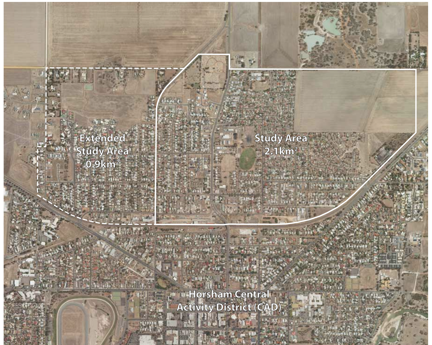
Study Area Map