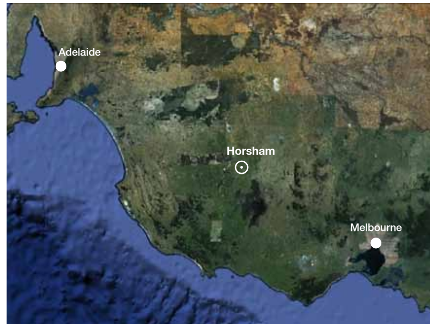
Location of Horsham in Relation to Melbourne & Adelaide