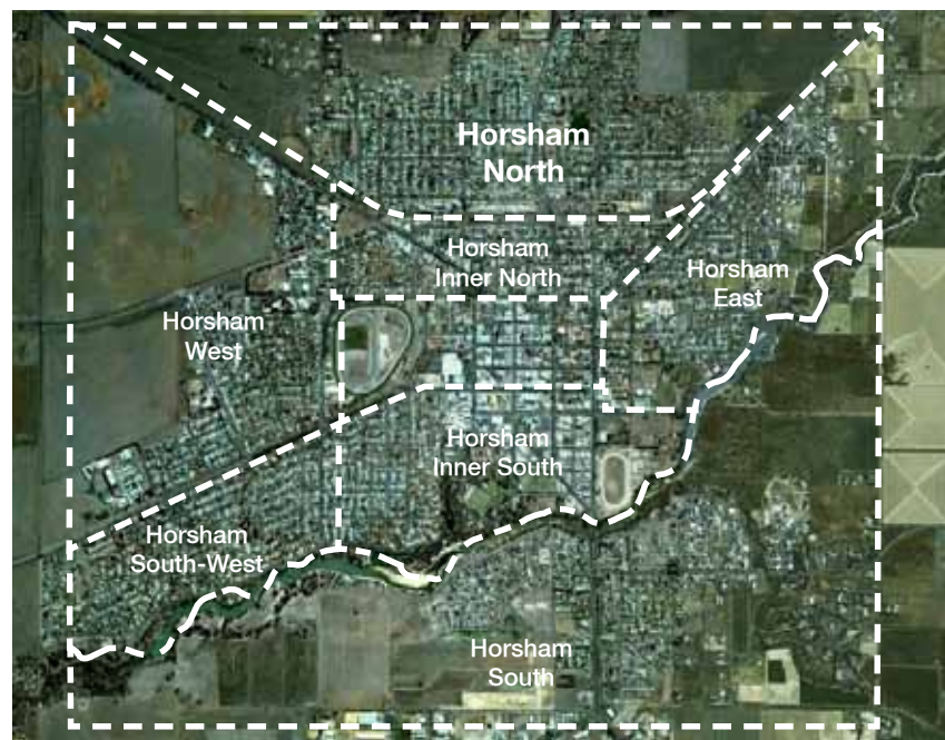
Location of Horsham North in Relation to the Wider Area