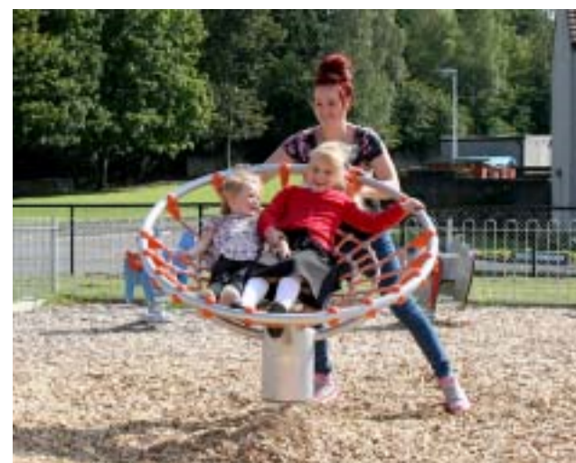
1 Inclusive play equipment - Access Whirl