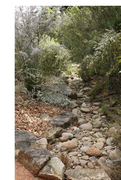
11 Wetland drainage swale with local rock