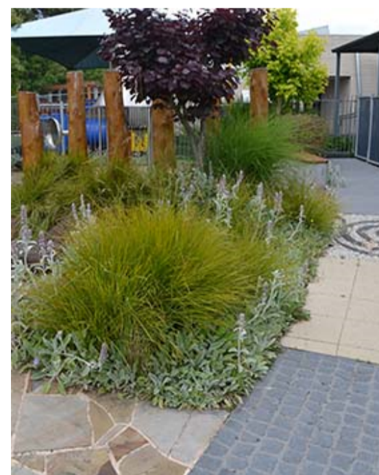
16 Therapeutic Garden - textural planting

Possible development of existing bowling greens 1 - Proposed stage 1 2 - Possible stage 2