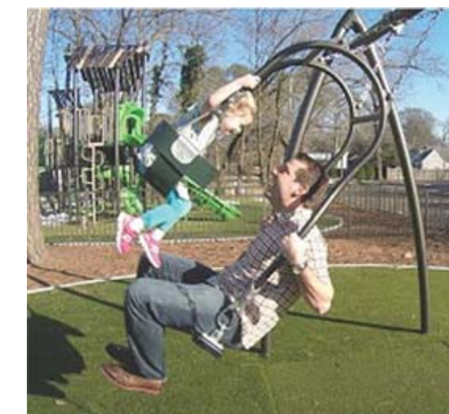
6 Expression Swing