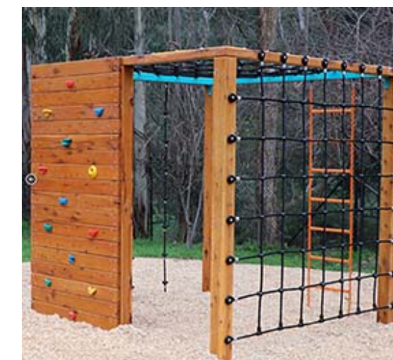
5 Climbing Cube