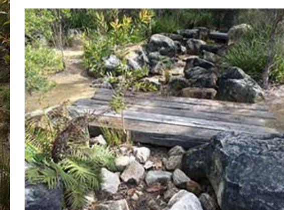
10 Wetland drainage swale with local rock