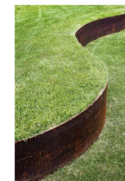
7 Iconic Australian Corten steel edge seat to cricket oval