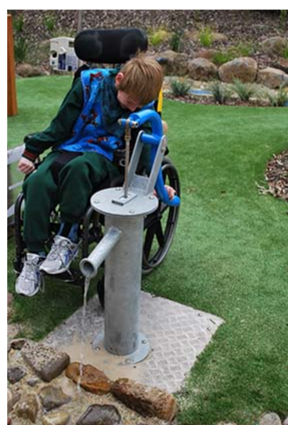
17 Therapeutic Garden - hand operated water pump

Possible development of existing bowling greens 1 - Proposed stage 1 2 - Possible stage 2