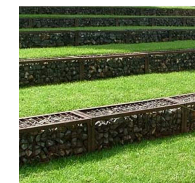
9 Iconic Australian gabion local rock seat edge to cricket oval