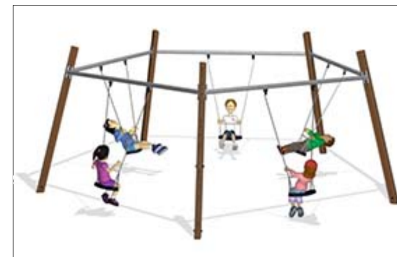
4 Social interaction 5 way swing