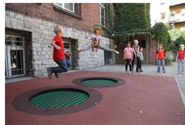
2 Inclusive play equipment - Inground Trampoline