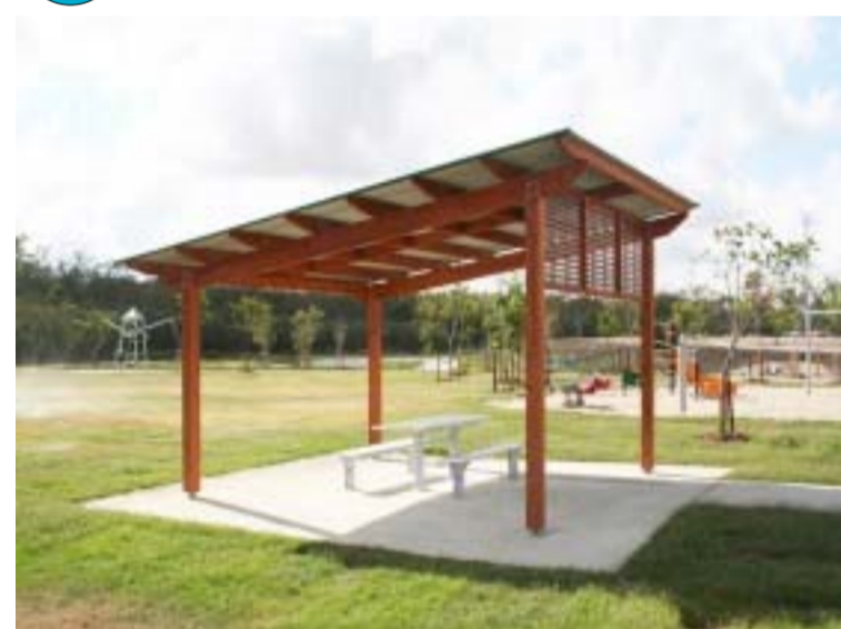
19 Shelter - skillon roof