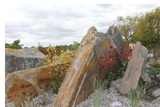
13 Local rock focal points