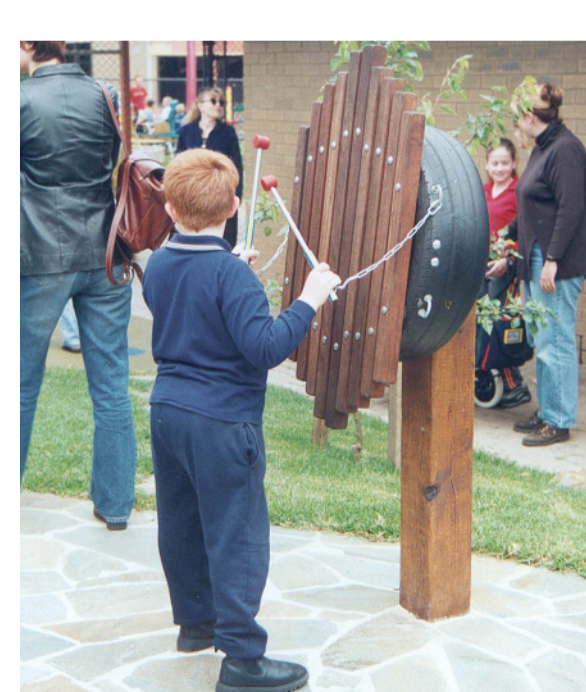
15 Musical Elements (HAPI sound artist)