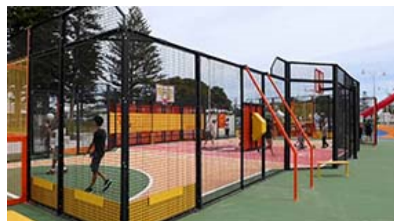
21 Multiple Sport Facility