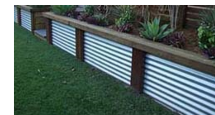
8 Iconic Australian corrugated galvanised steel & reclaimed hardwood timber seat edge to cricket oval