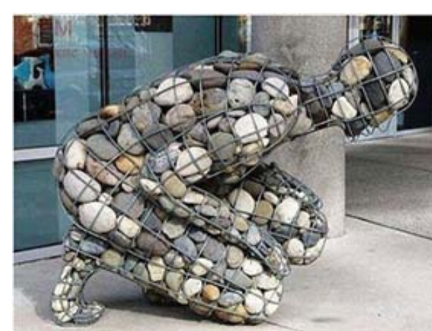
14 Sculptural gabion local rock focal points