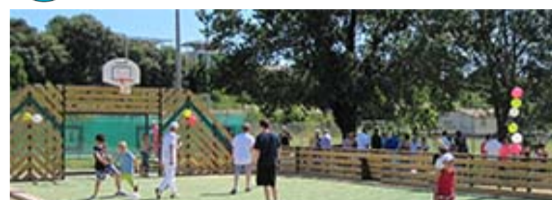
20 Multi Sport Facility