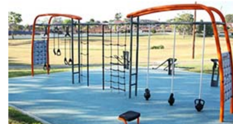
12 Inclusive fitness equipment