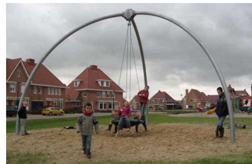
3 Inclusive & Senior play equipment - Giant Swing with birds nest