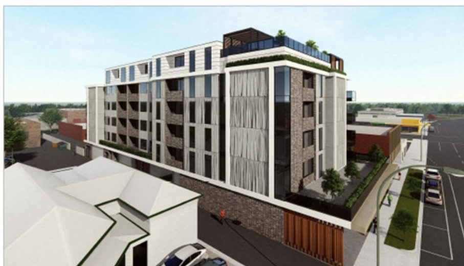
01 EAST VIEW NTS

Planning and Building Permits have been strong and consistent with previous years. Council is currently considering a number of major projects including housing and serviced apartment investments which will require Council decision. Both services have adapted to online and remote delivery to ensure development and construction projects can continue to be delivered.