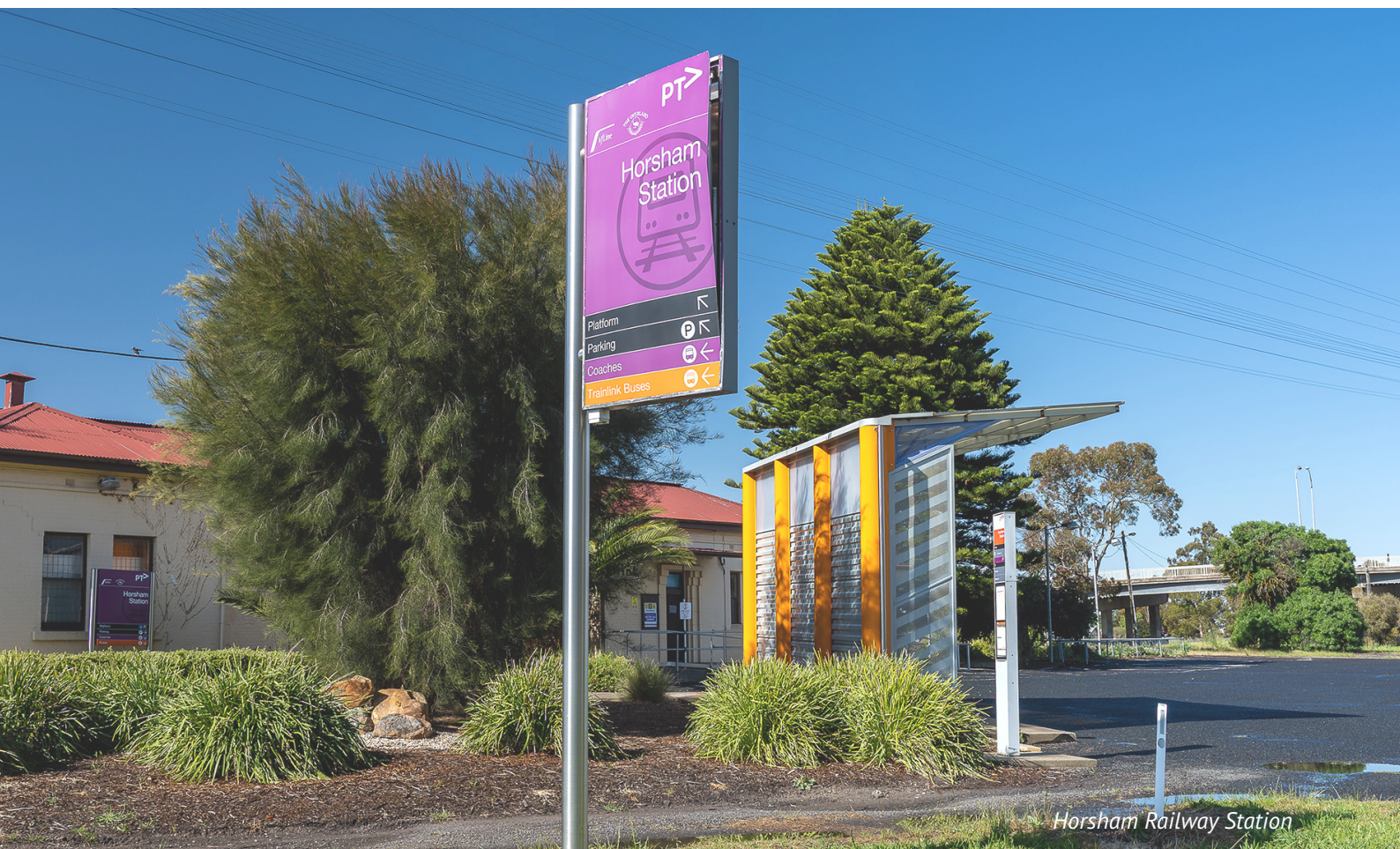
Horsham Railway Station

Plan for future redevelopment areas (subdivisions)