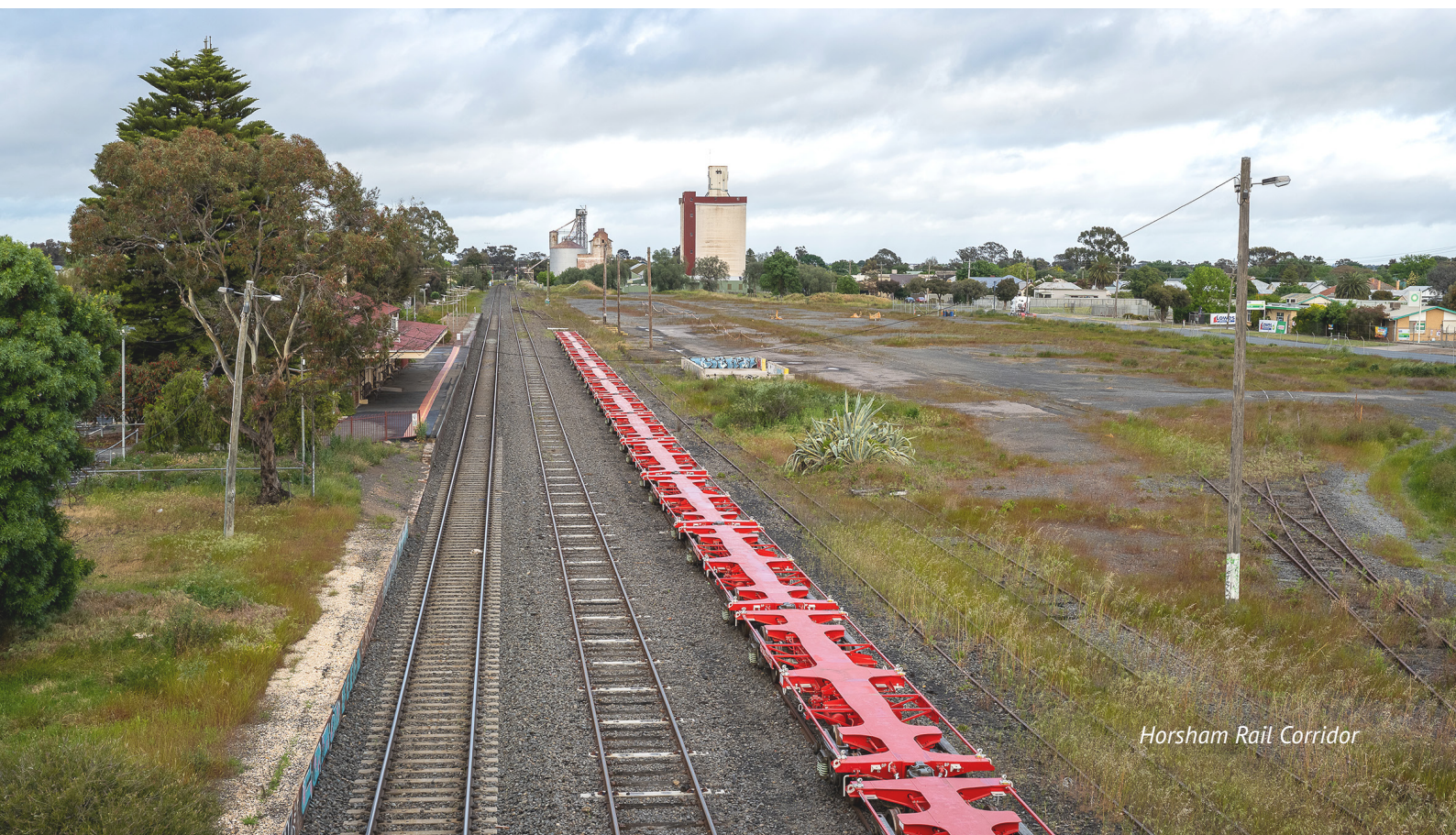
Horsham Rail Corridor

Part 4 discusses the parks and other public spaces throughout Horsham North, identifying some of the issues and opportunities to improve public spaces throughout the area. Parks should be safe, inviting, and attractive, user-friendly spaces, with good pedestrian connections.