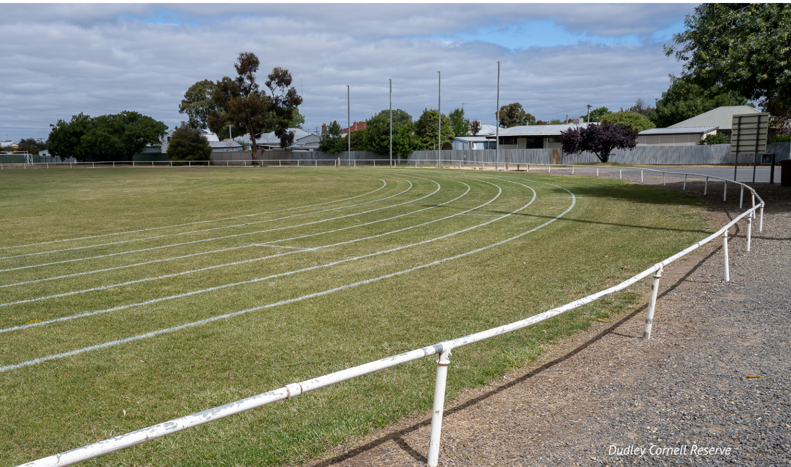
Dudley Cornell Reserve