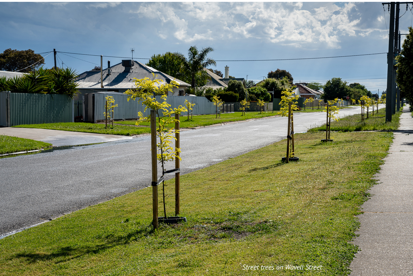
Street trees on Wavell Street

Of course, there are limits and constraints, which is why the Draft Issues and Opportunities Paper provides a basis from which to start the discussion with the community and to work towards some achievable goals for the area, over the short, medium and longer term.