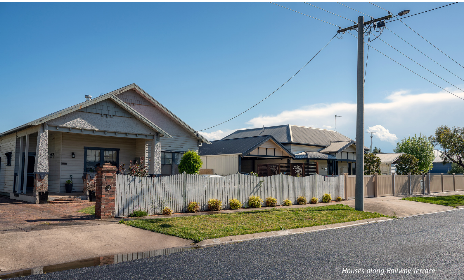
Houses along Railway Terrace