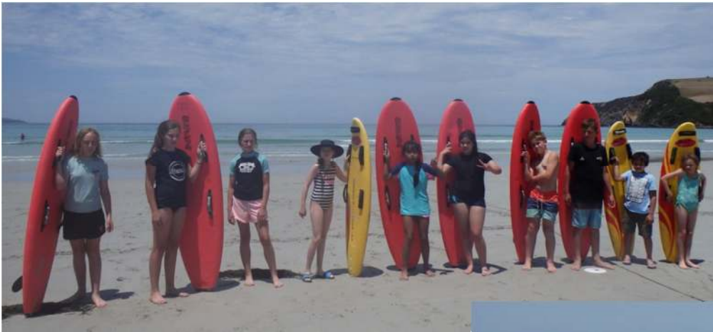
Laharum Primary School students enjoying their time at Cape Bridgewater