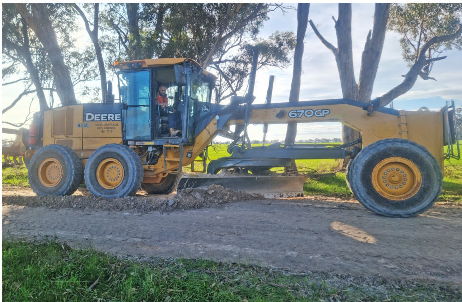
CATCHING UP: Roads are being graded in Taylors Lake, Green Lake, Laharum, Brimpaen, Dooen and Quantong throughout this week and next week.

Meanwhile Council is using government funding to complete flood recovery works on roads specifically damaged in the 2022 Spring Flood.