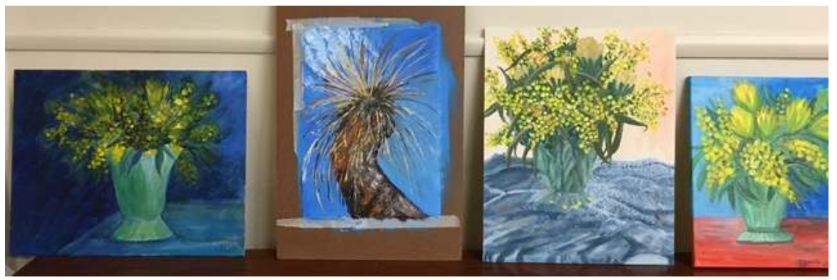
Results of the artists painting workshop ^