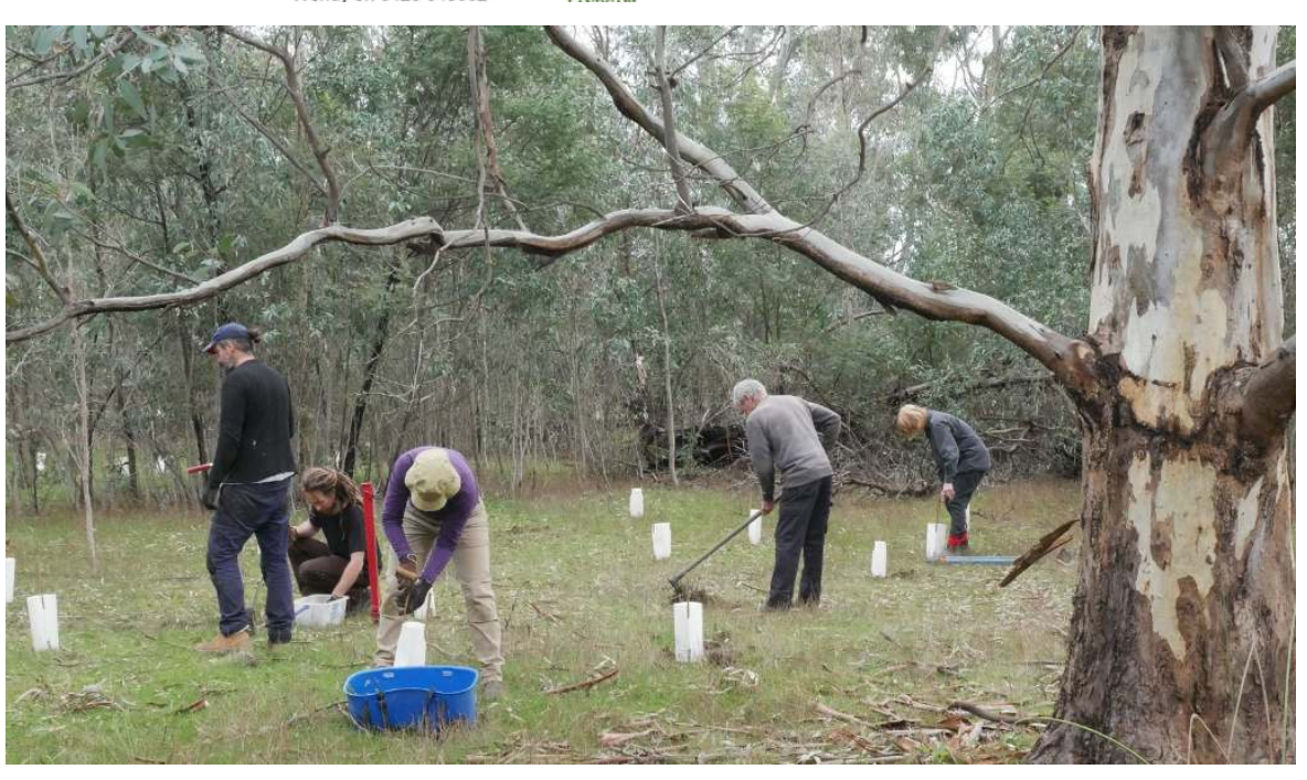
Plantout at Wartook Rise on Sunday July 30

Enjoy the friendship – it's lots of fun! If you haven't been before, come and give it a try! Minimal charge Singing ability definitely not necessary