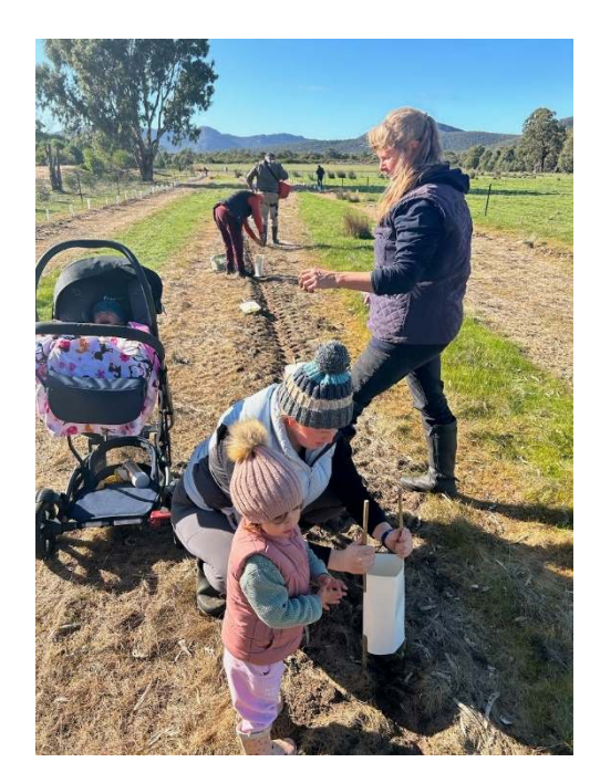
Plantout at Wendy's on Sunday July 2 ↑ Final result! ◆