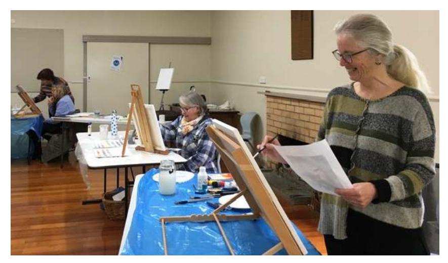
Artists at work! Laharum Hall on weekend of August 5 & 6