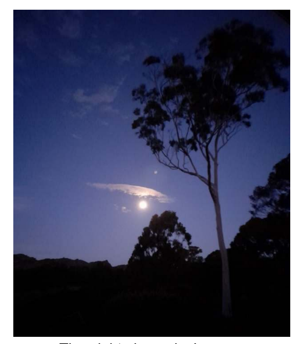
The night sky early June