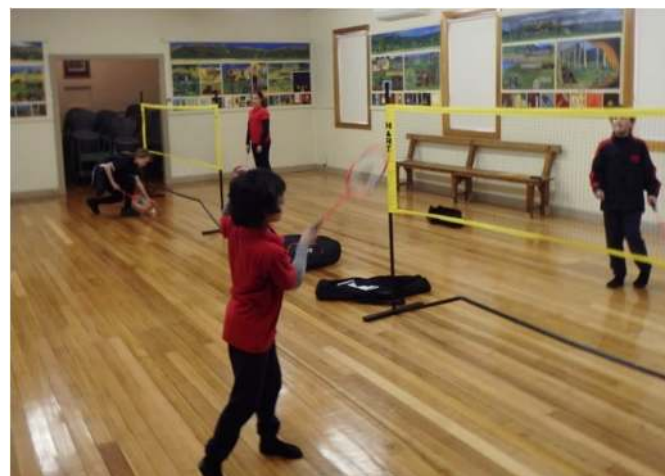
Laharum PS students playing badminton in Laharum Hall