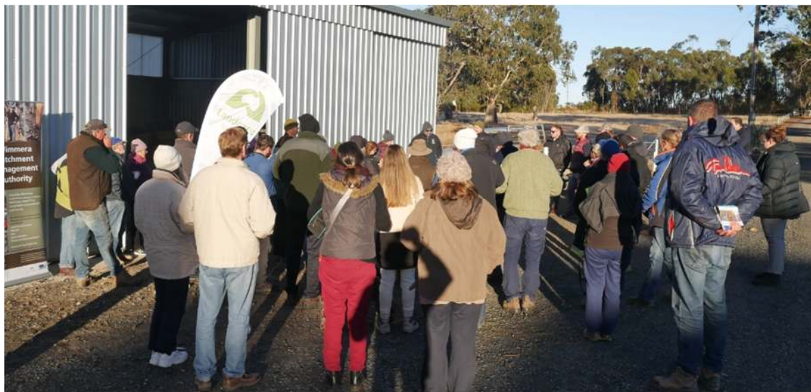
A large gathering at the Platypus Breakfast on April 21 in Wartook

It was great we could enjoy Easter with family and friends this year without restrictions. Hopefully it's been suitable weather for planting crops.