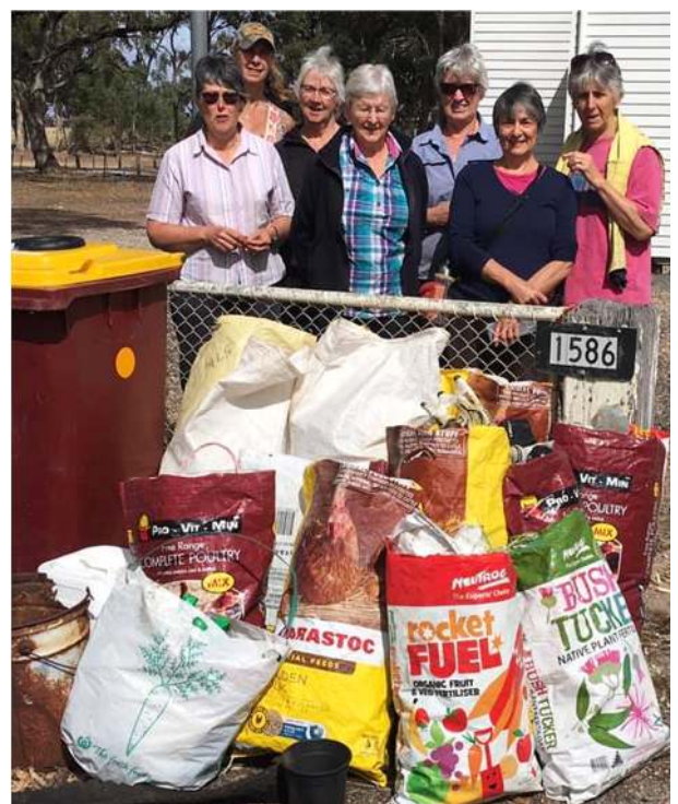
Wednesday Walkers after their road-side collection