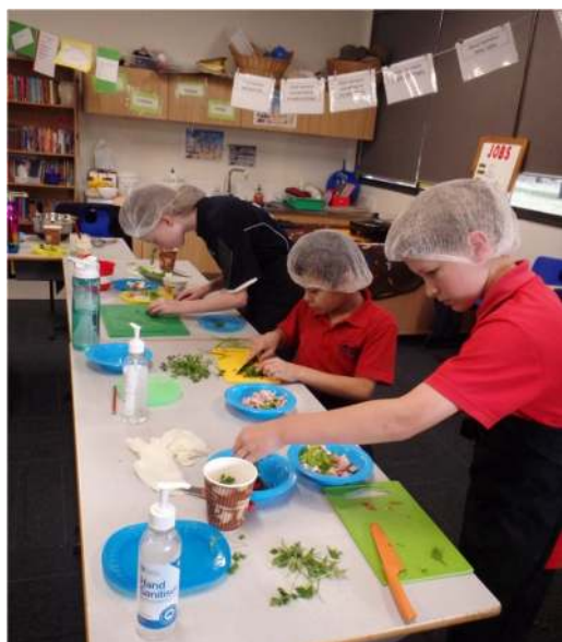
Students busy preparing their meal ↑ ↓