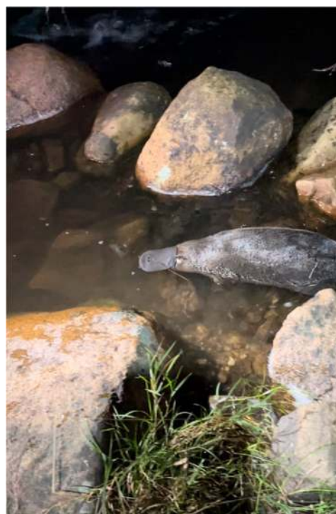
Platypus found in MacKenzie River during the survey