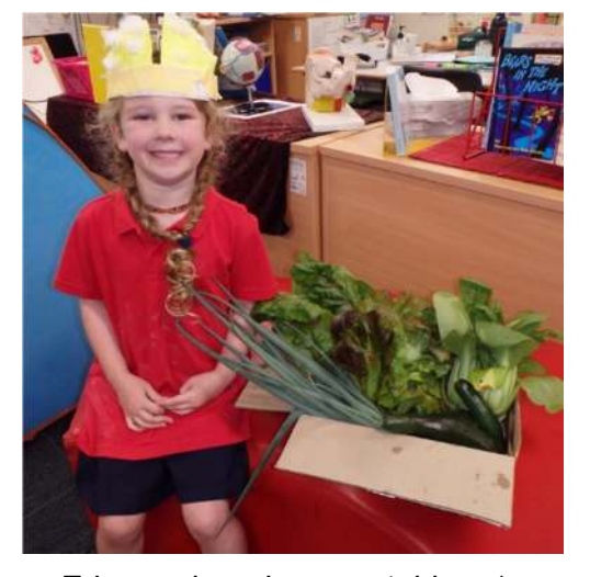
Eden and garden vegetables 🏚