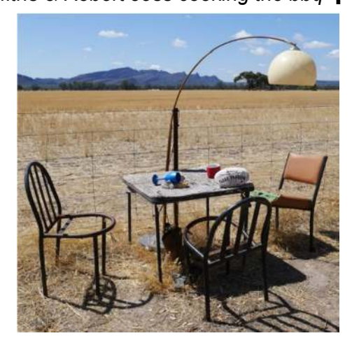
Used to be a great stop for a view!! •