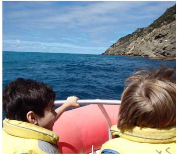
Seal colony tour 1