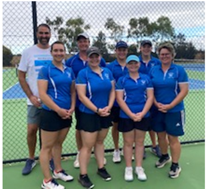
Brimpaen A Special Tennis team