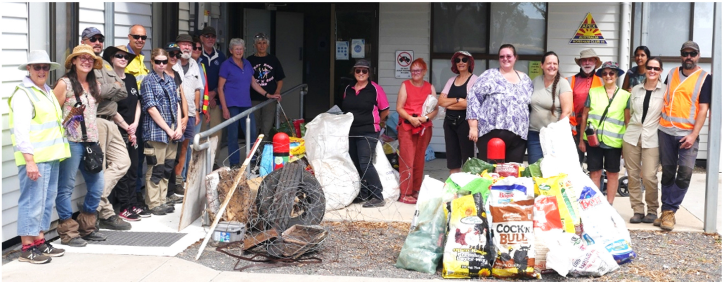
Clean Up Laharum Day Sunday March 5

The morning's Clean Up of the roadside on 'Clean Up Australia Day' was successful with a collection of both recycling and non-recycling rubbish within an area of about 15kms.