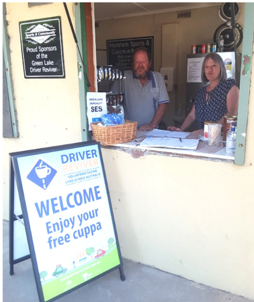
Lion's 'Driver Reviver' at Green Lake