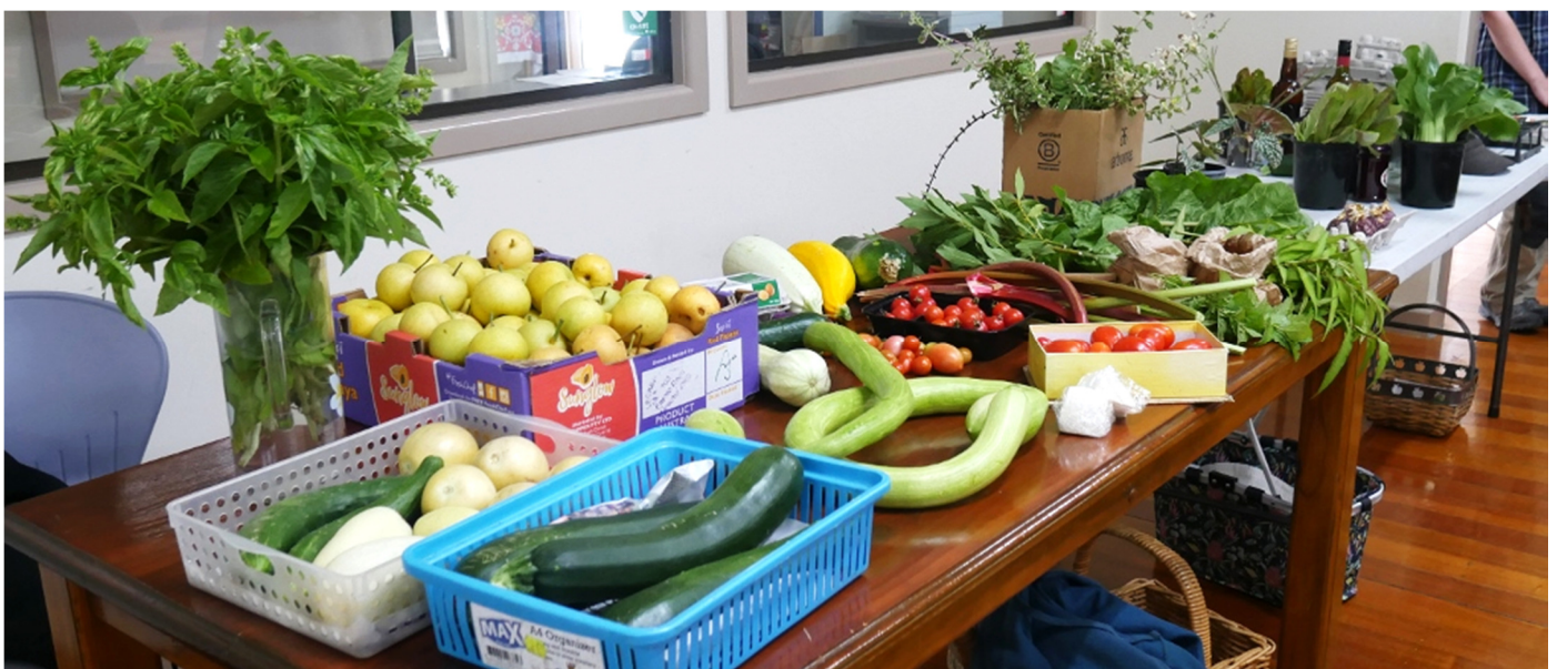
March Laharum Wartook Veggie Swap, Laharum Hall