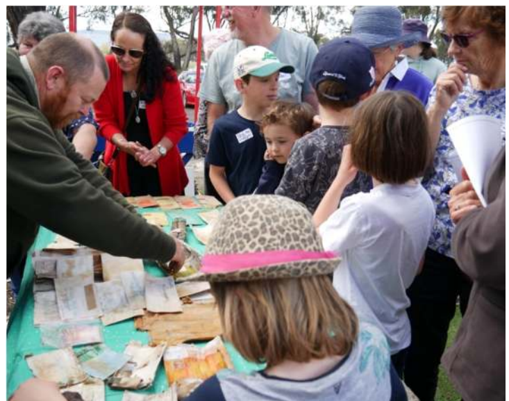
Checking out letters removed from the 1987 time capsule at Laharum Primary School's 135 Years Celebration