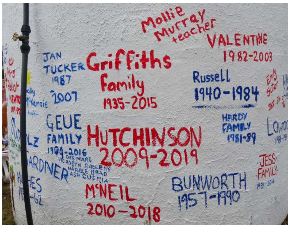
Present & past Laharum students signed names on the tank at the back of the school