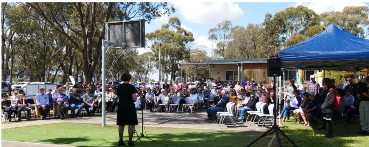
Celebrating 135 Years of Education at Laharum Primary School on Saturday November 5

What an extraordinary spring we've experienced – so much rain and growth!!