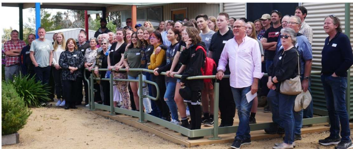
Past students of Laharum Primary School