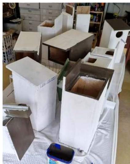
Some of the made bird boxes