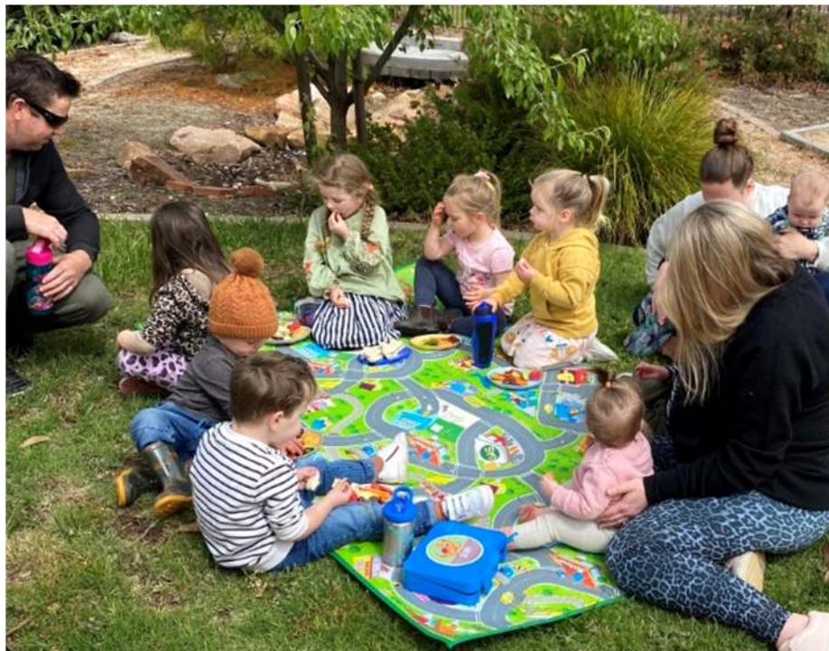
'Laharum Lorikeets' playtime group enjoying a snack

This Newsletter was successful in receiving funding of $1,770 from Horsham Rural City Council which is a great contribution to the cost of printing.