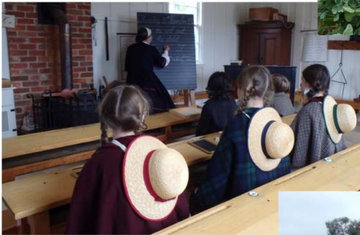
Laharum PS students at Red Hill National School