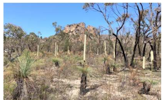
Result of a planned burn conducted at Friedmans Road in March this year