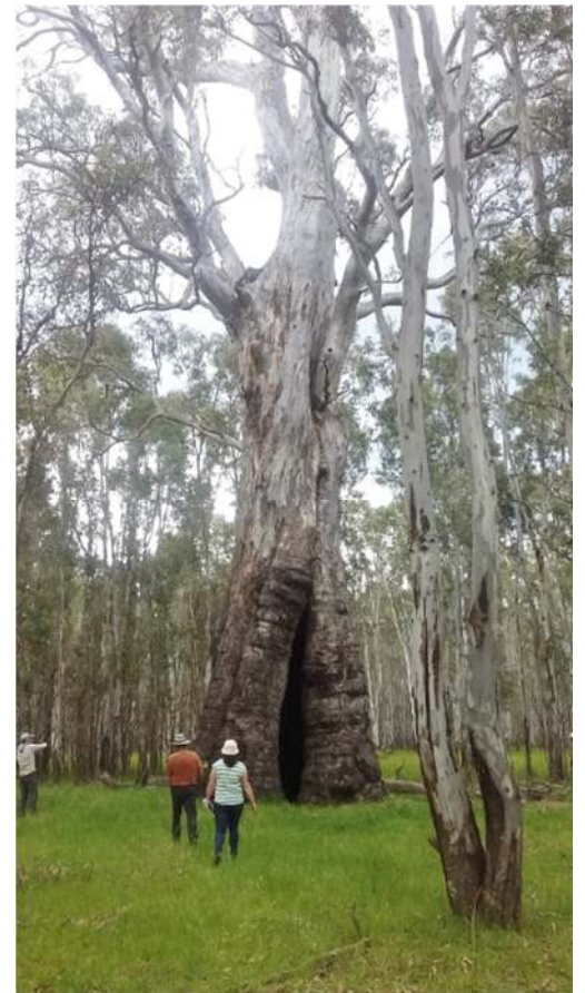
One of the tallest red gums in Victoria ↑