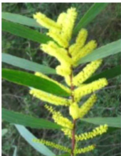
Sallow Wattle, the 'Golden Invader'