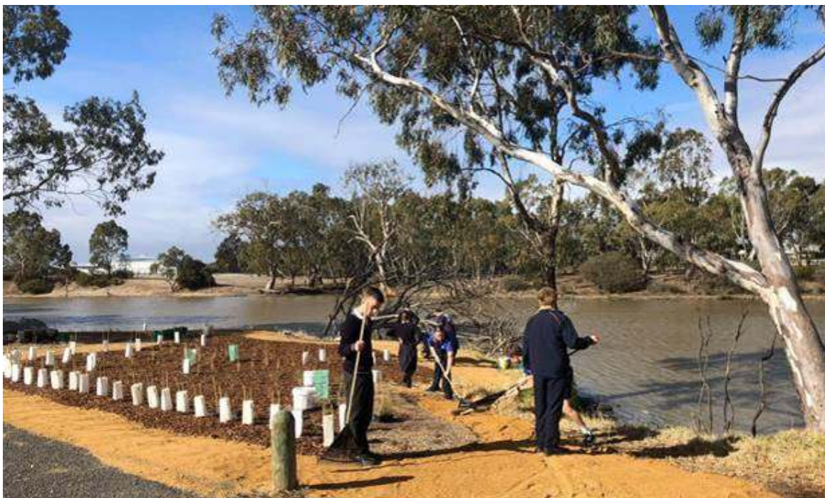
Planting a native grassland on the Wimmera River bank

Although rain has not been plentiful, let's hope there's more to come to help with sowing crops and promoting growth. It is great to enjoy some sunny winter days and to see tinges of green appearing.