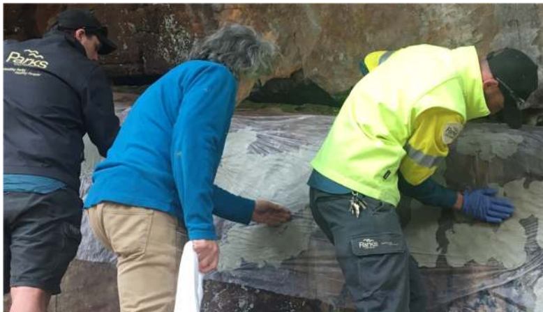
Removing graffiti in Grampians National Park