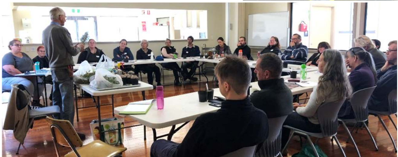
Attendees at the native plant propagating workshop in Laharum Hall