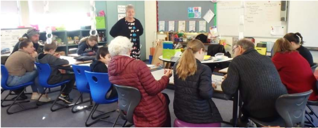
Snap shots of Laharum Primary School students