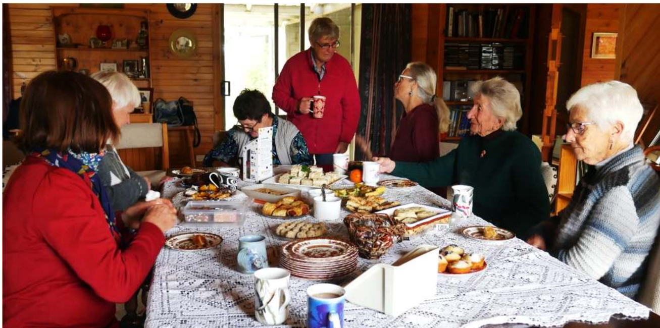
A Laharum Biggest Morning Tea gathering & fundraising event in May