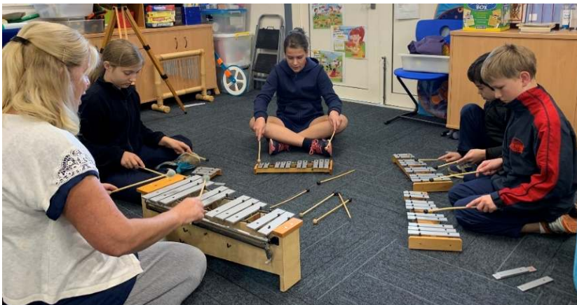
Students participating in the Duet Song Room Program