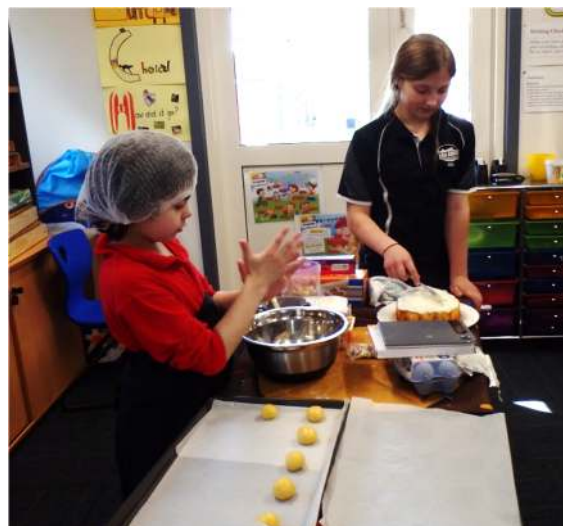
Procedural reading tasks at school