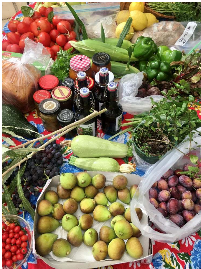
Colourful display of the March Vegie Swap