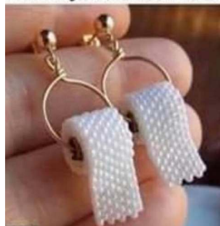
Commemorative jewellery to always remember 2020