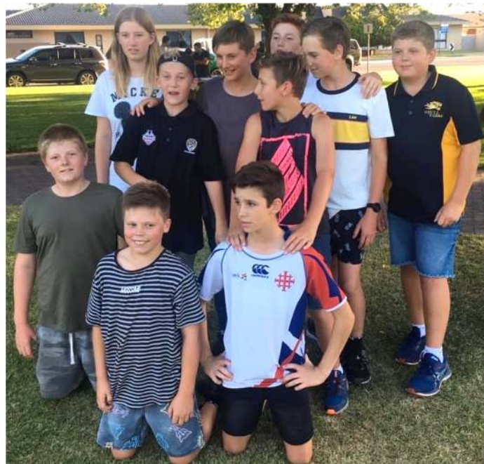
Cricket U14 team at their closing celebration evening