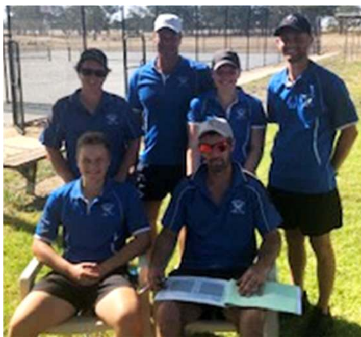
Brimpaen Pennant tennis team