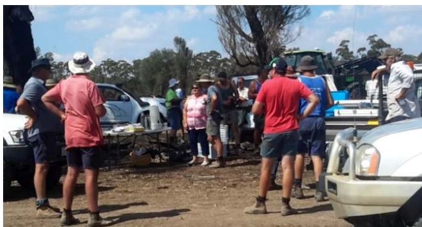
Gathering before the working bee →