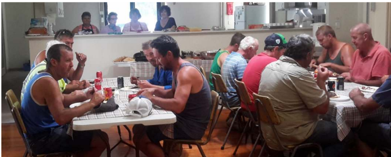
Volunteers having a well-deserved lunch at Laharum Hall during the fencing working bee on February 7