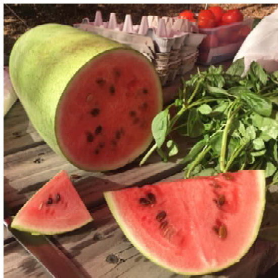
What a whopper – sampled at the last Vegie Swap!