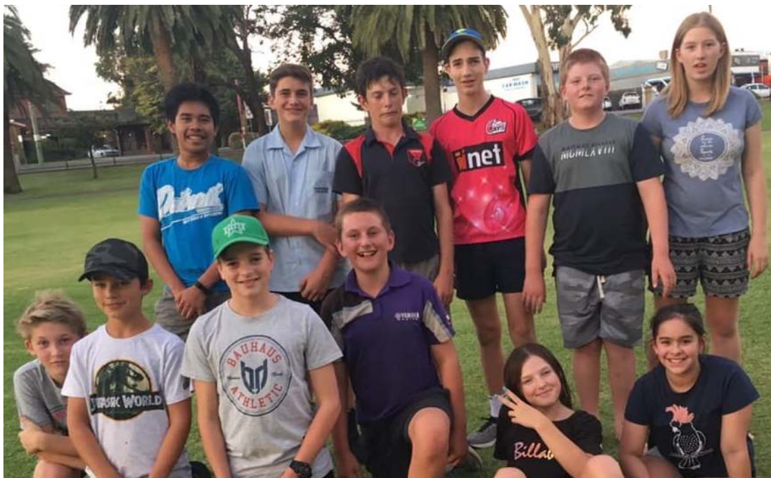
Laharum Junior Cricket team

It's now April and we've experienced some lovely autumn weather, but we just need the rain! Let's hope for a good season for growing crops and gardens, and no late bushfires!