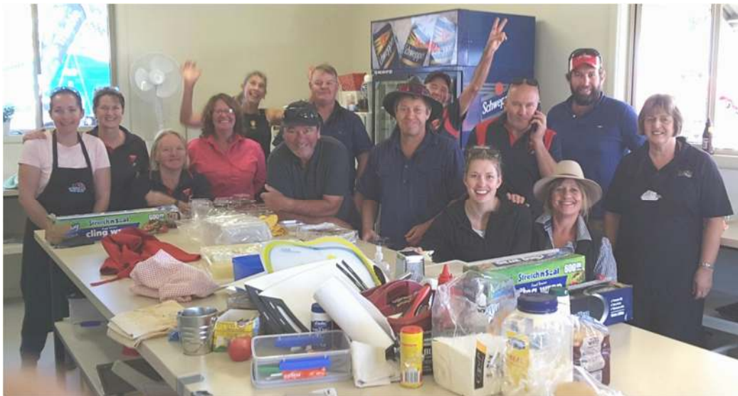
Helpers who catered for the Field Days as a fundraiser for Laharum Football Netball Club