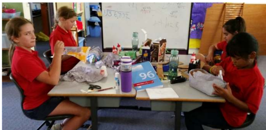
← Laharum Primary School girls designing