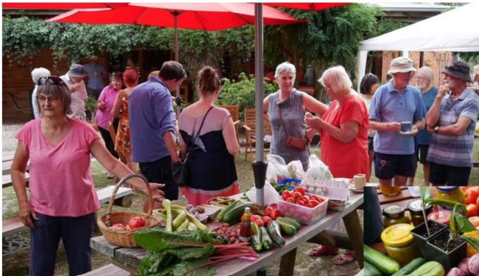
Vegie Swap at the Wander Inn in March and more of the produce