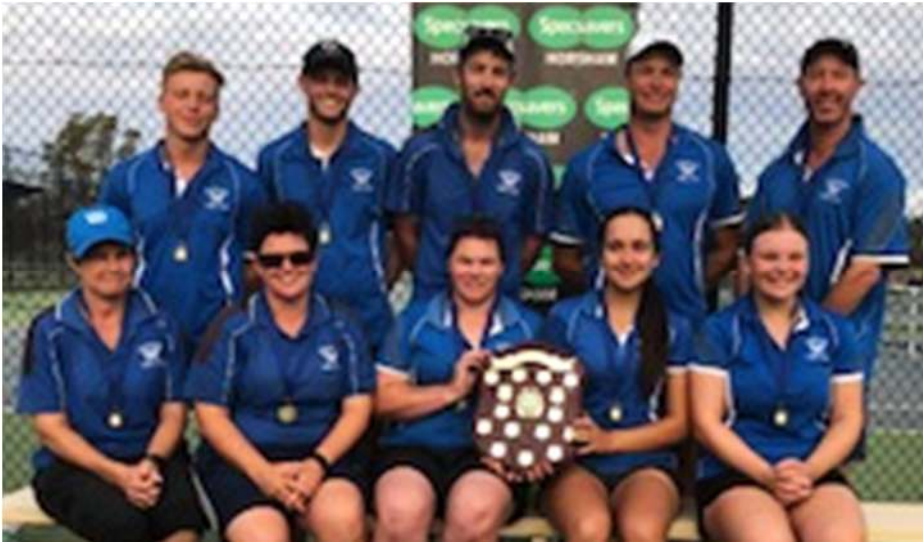
Brimpaen A Special premier tennis team!