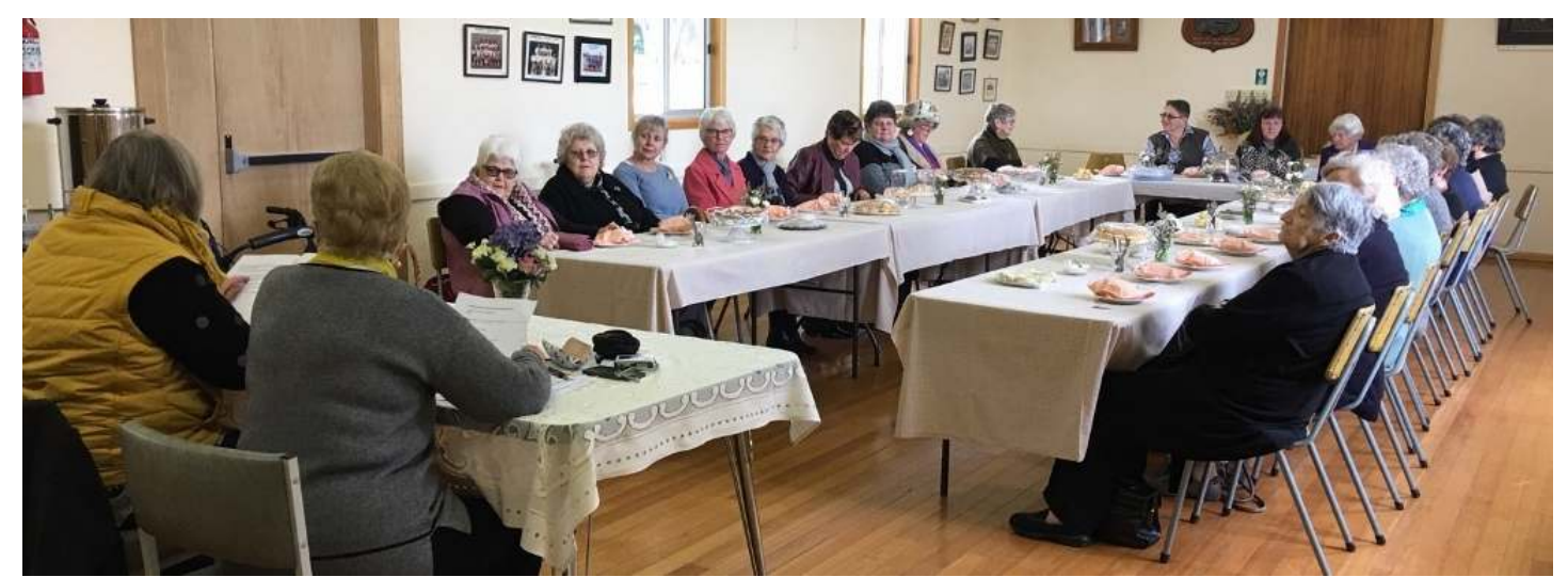
Attending the final of Brimpaen Ladies Social Club and celebrating their 60th birthday