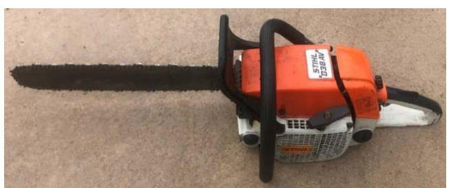
Chainsaw for sale – details in Luke Dumesny's article on page 5