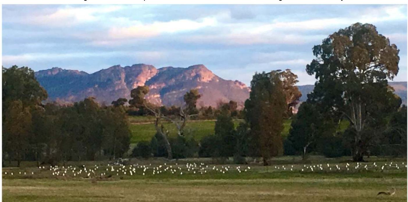
Evidence of Laharum Primary School planting in June – what a view!