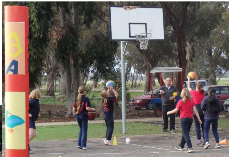
Students playing basketball →