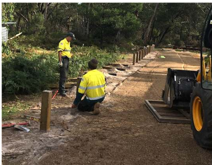
Parks operations team replacing bollards