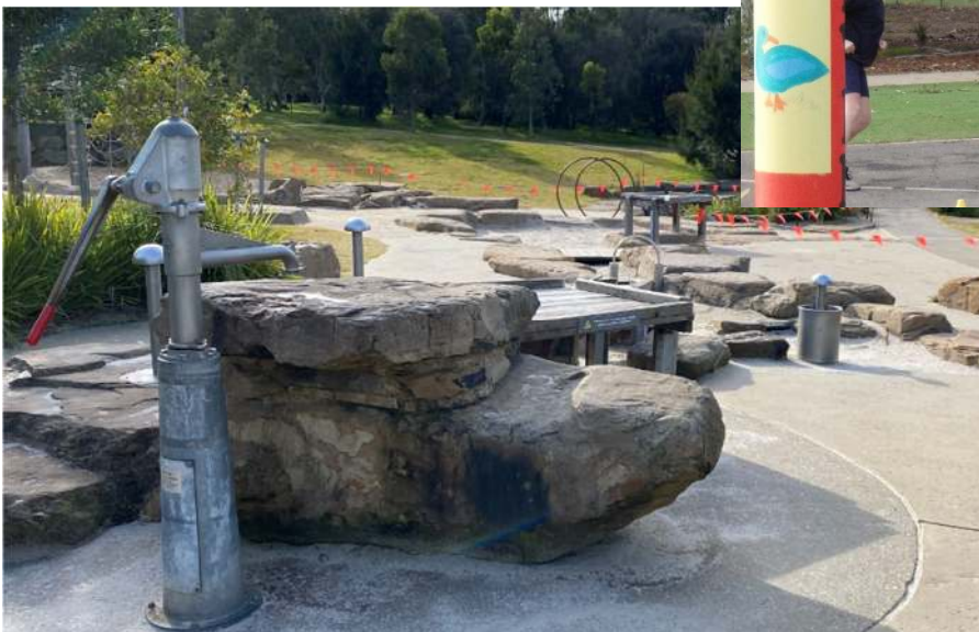
← Example of a water play area