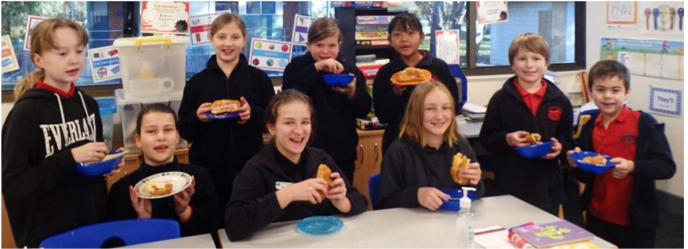
Laharum Primary School students enjoying Bastille Breakfast ↑