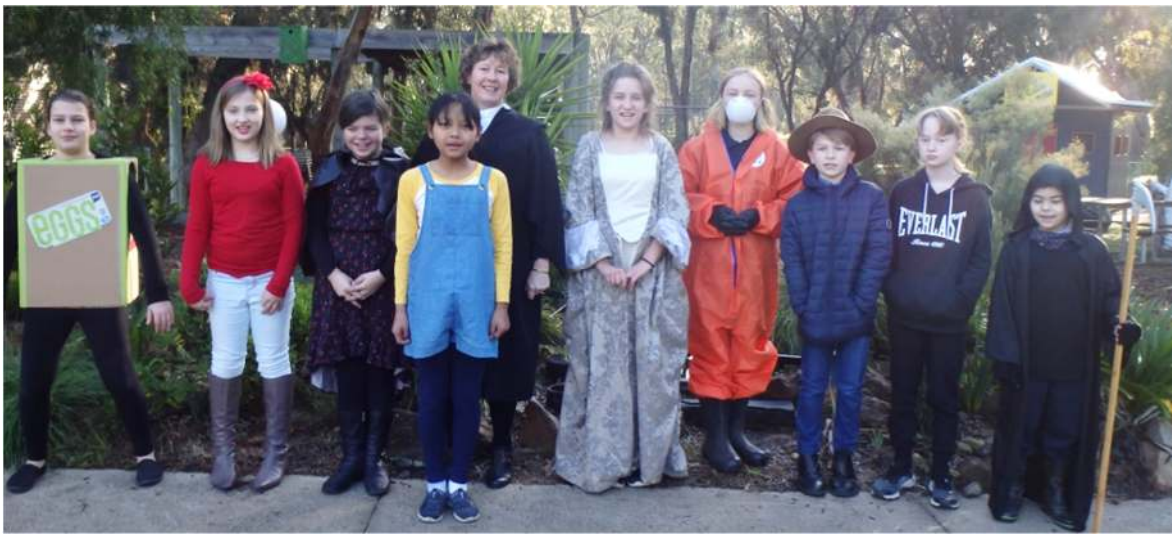
Dress up day end of Term 2 ↑