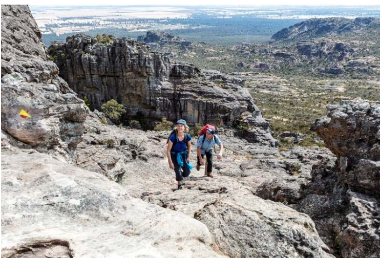
Grampians Peak Trail