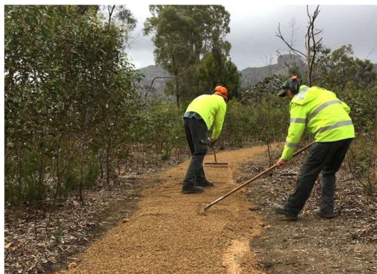
Stapylton loop walking track works