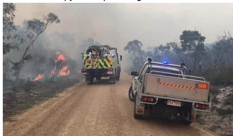
Planned burning and fire prevention works

Contact Isabelle Martin for face masks on 5383 6229 ↩