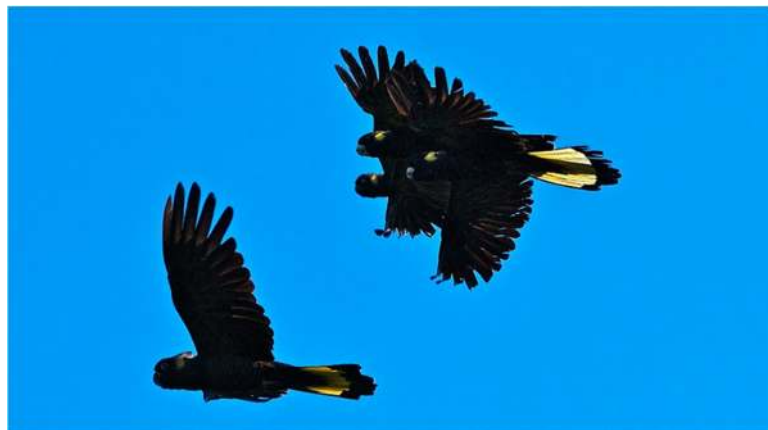
Yellow-tailed Black Cockatoo ( Calyptorhynchus funereus )