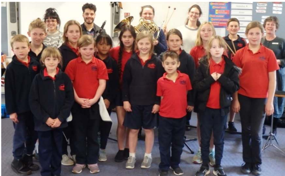
Melbourne Symphony Orchestra visited Laharum Primary School students in November