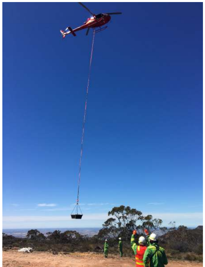
Successful airlift by ParksVic staff was completed to empty the toilets at First Wannon, the remote hike-in camp on the Major Mitchell Plateau