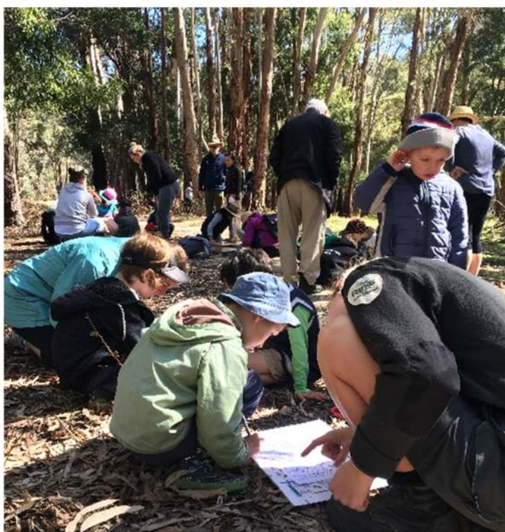
Holiday school program led by ParksVic