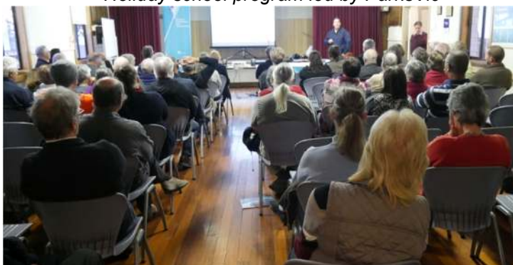
Crowd at the mining meeting November 12, Laharum Hall