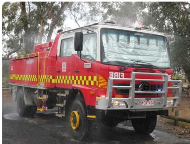
A practice 'Entrapment Drill' in Tanker 1 at the Wartook Laharum Community Day showing all systems going ↑ Everyone enjoying a catchup at the Vegie Swap →