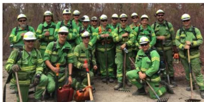
Grampians Region Task Force 2 November