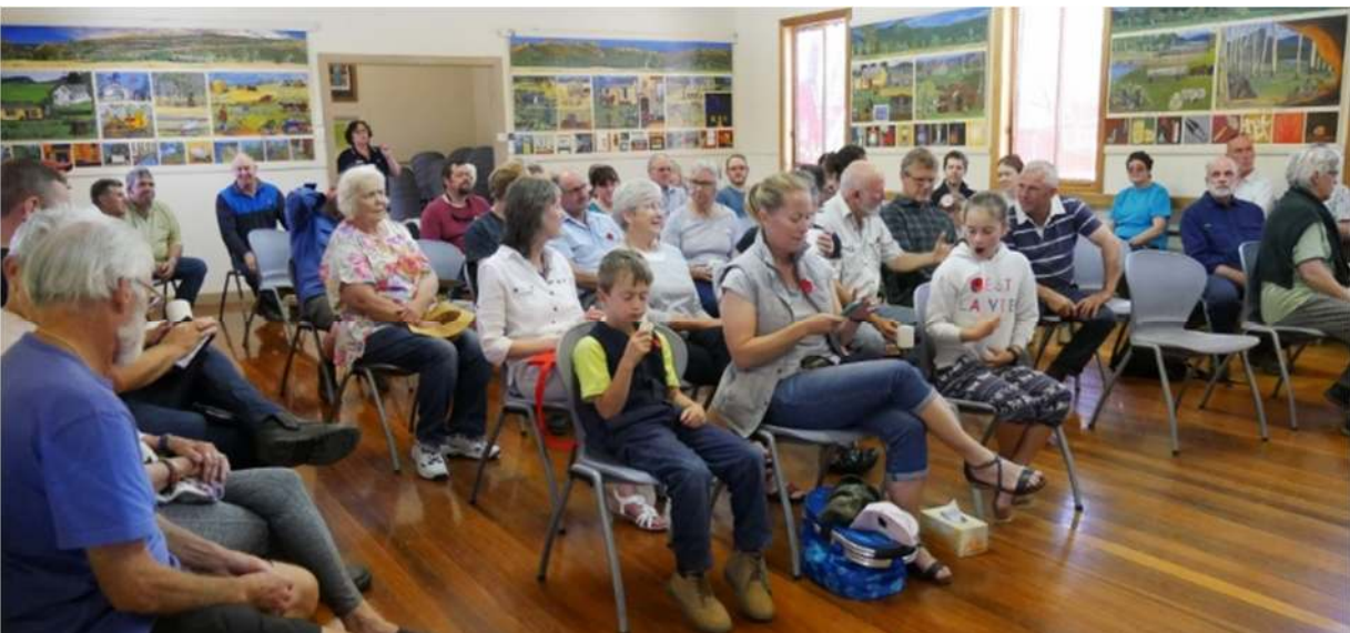
Attendees at the CFA information session on November 11