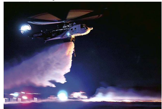
Night bombing aircraft