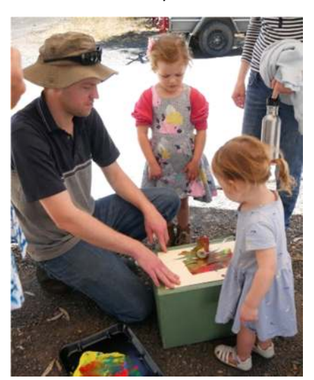
Children stencilling gum leaves on their bird boxes

Time to choose some local produce and preserves – what a selection! →