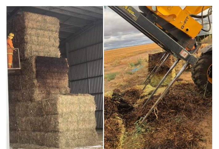
Haystack fire in Rupanyup - beginnings of spontaneous combustion