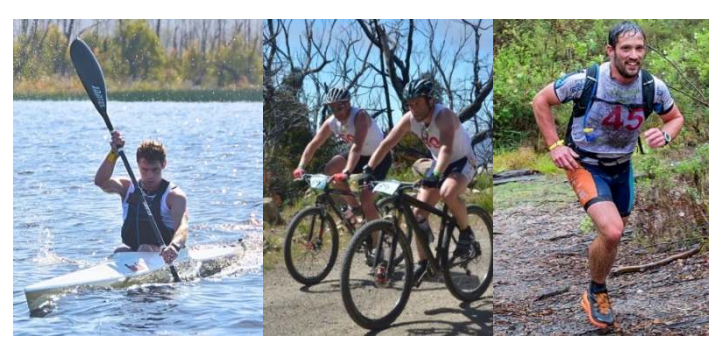
Grampians Challenge activities for 2019