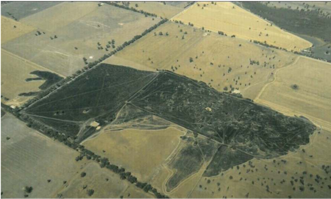
Laharum-Barkers Road Fire taken on Boxing Day from Firebird 300