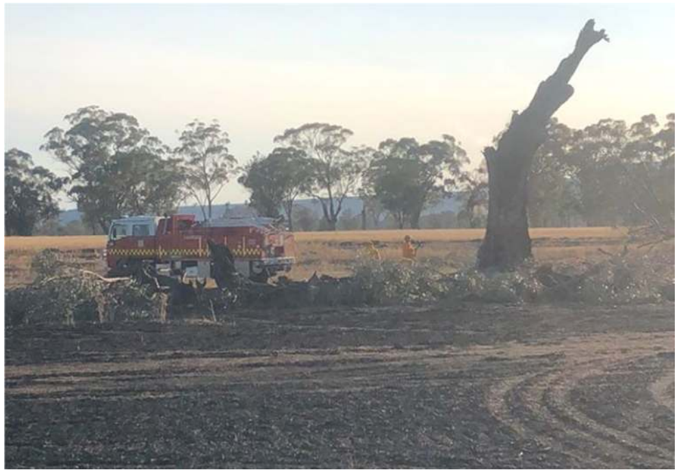
Laharum Tanker 1 crew blacking out Christmas morning