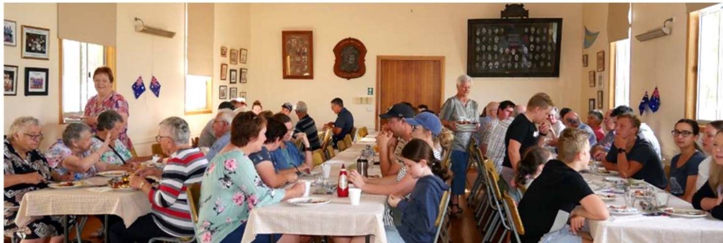
Participants enjoying Brimpaen's Australia Day Breakfast

We have certainly experienced extreme weather conditions over the last couple of months, and trying to maintain some energy levels has been challenging! Also a lot of stress is put on families & children, farmers & outside-workers, animals and of course keeping up the watering of our gardens. Let's hope for significant rain!