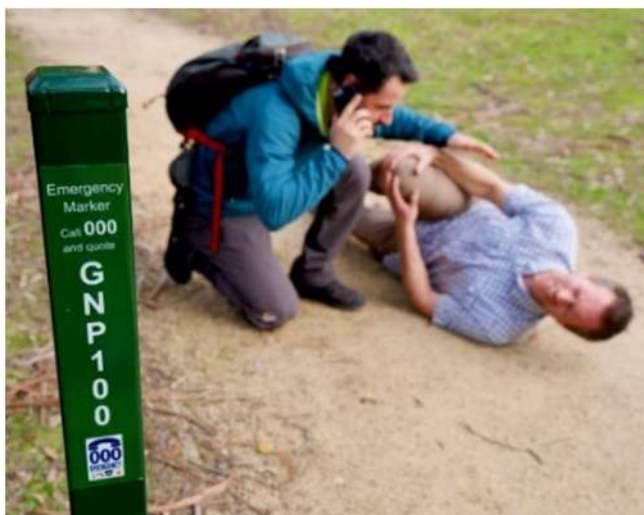
Emergency Markers throughout Grampians National Park