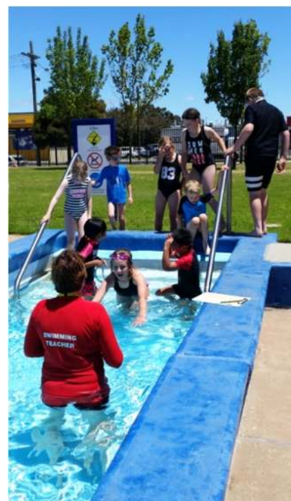
Laharum Primary School Swimming program last November