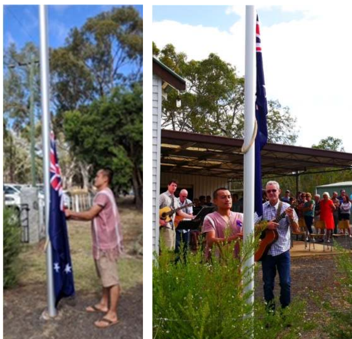
Raising of the flag and singing the National Anthem at Brimpaen Australia Day Breakfast