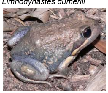
Pobblebonk (Banjo) frog Limnodynastes dumerili