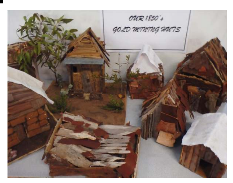
Gold miners huts Laharum Primary School students completed whilst remote learning