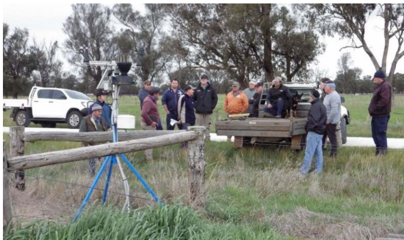
Wonwondah Landcare members checking a weather station