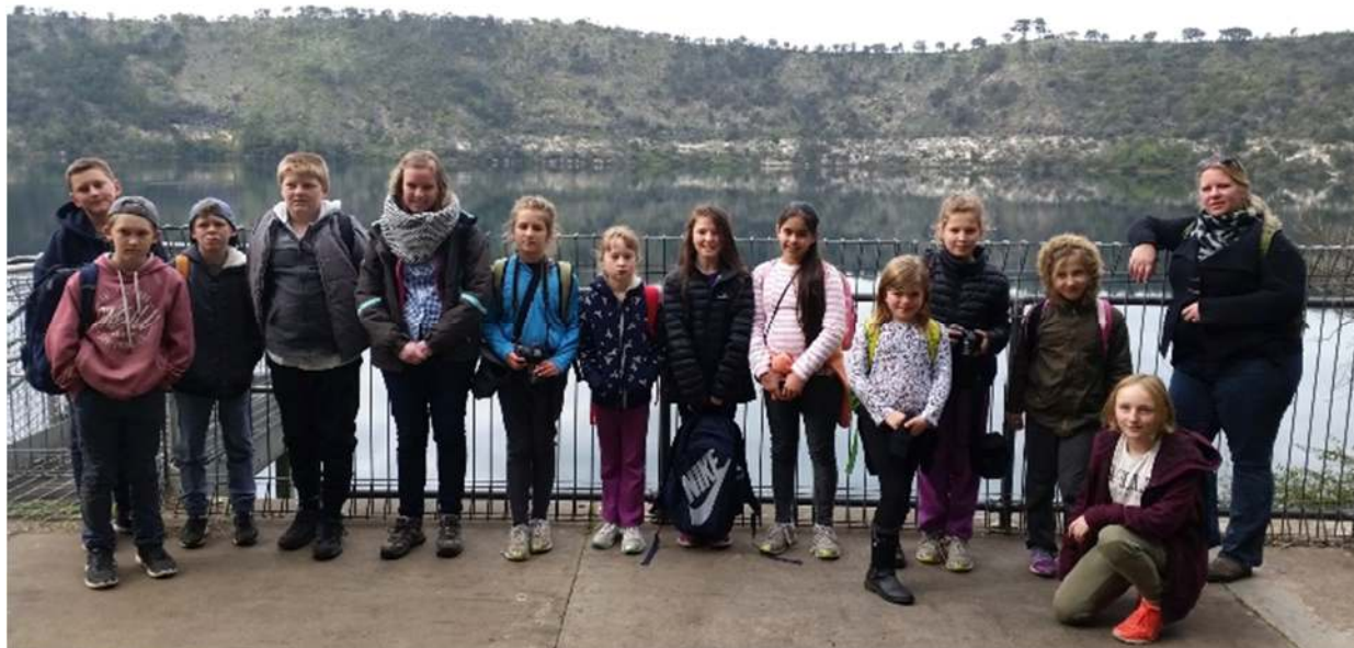
Laharum Primary School Years 3-6 students on camp at Mt Gambier

I greatly appreciate the donations received from individuals, groups and advertisers for this Newsletter – this makes it possible to continue for another year. Thank you!