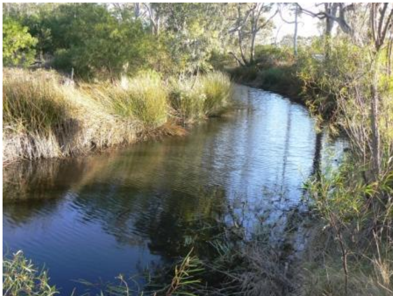
Mt William Creek

The Mt William Creek winds its way through Dadswells Bridge providing not only a valuable water source for the town, but also an environmental and recreational feature. Mt William Creek starts in the Mt William Range of the Grampians and enters the Wimmera River after flowing