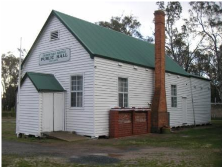
Dadswells Bridge Public Hall