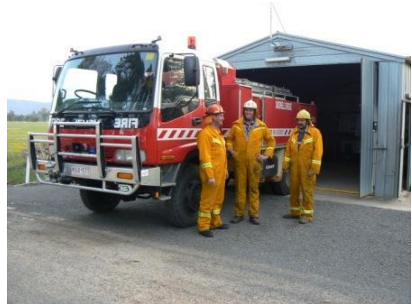
Dadswells Bridge Brigade

In 1945 the Bush Fire Brigades were reorganised to become part of the Country Fire Authority, and the name then changed to Dadswells Bridge Rural Fire Brigade. The Brigade has come a long way since the days of fighting fires with beaters, rakes and shovels, knapsacks and hand operated pumps. Today's Brigade boasts a modern 4-wheel drive tanker with high capacity diesel pump, fog and foam sprays. This tanker is supported by a community owned tanker and quick fill pump. All community members are encouraged to join and take their part in the crucial role the Fire Brigade plays in this area, and in the broader community. Membership involves regular training to ensure qualification and fire fighting skills are maintained.