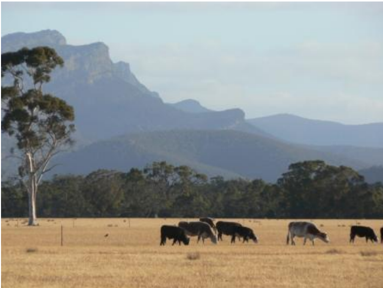
View of Roses Gap

The plan will be used by the Dadswells Bridge Progress Association and other community groups to provide a basis for action and to give an indication of community priorities for the area.