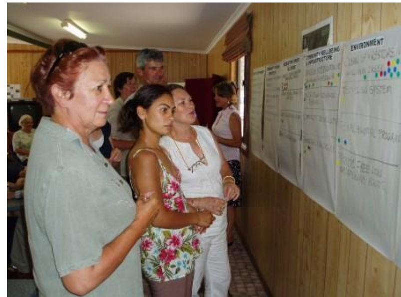
Casting a vote at the Community Workshop