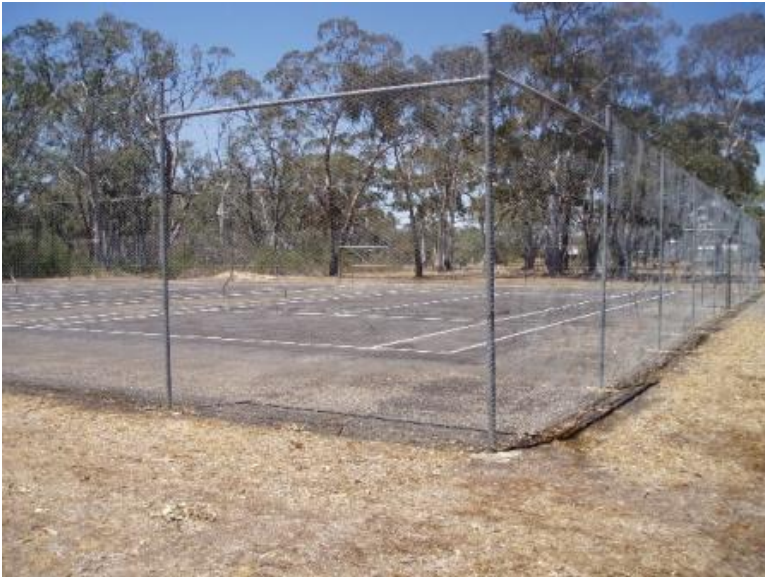
Dadswells Bridge Tennis Courts

The first tennis courts were established in 1926 adjacent to the Mt William Creek by the residents of Dadswells Bridge and surrounding area. After the Second World War the tennis courts were sealed and two new courts and sheds were constructed. Local dances were commonly held in the Hall to raise funds for the Tennis Club. The Tennis Club has provided the community of Dadswells Bridge not only a place for exercise and competition, but also a social place for the community to gather.