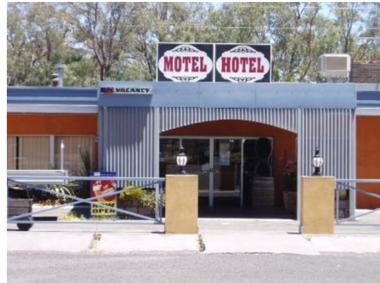
Dadswells Bridge Motel Hotel

through Dadswells Bridge. The reach of the Creek from Lake Lonsdale to the Western Highway varies in condition and is identified as a high priority waterway in the Wimmera Waterway Health Strategy (Wimmera CMA, 2006).