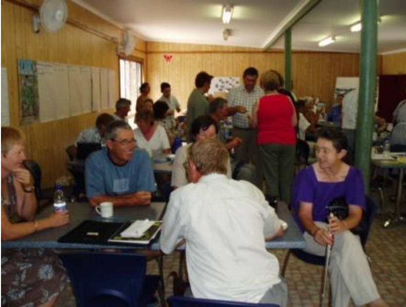
Community Workshop February 2007

This plan will guide actions for a period of time. It will be a living document and as actions are achieved, the plan will be reviewed to keep it live and relevant. New initiatives will be added to the plan during the review process and as the actions of this plan are successfully achieved. The plan will be reviewed by the Community Initiatives Group once a year. This group is under the auspice of the Dadswells Bridge Progress Association.