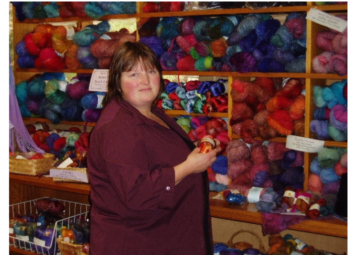
Wartook Artists Studio