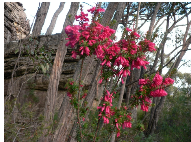
Wildflowers Grampians National Park