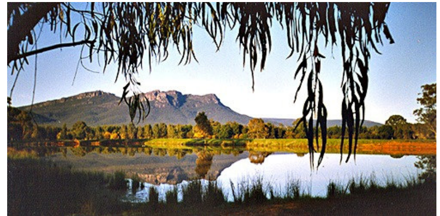
View of the Asses Ears

The MacKenzie River flows from Lake Wartook through this area and is in good condition. Platypus can be found in the upper reaches of the MacKenzie River. Other watercourses include Burnt Creek, Troopers Creek, Potters Creek and Boggy