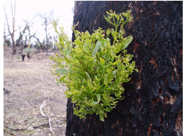
Regrowth in the Grampians