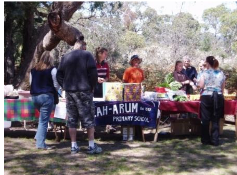
Market at the Wartook Pottery

In the area there are a number of businesses including food production, craft, retail, food catering, artists studio, fuel supplies and groceries. The area around Wartook hosts a number of accommodation facilities including bed and