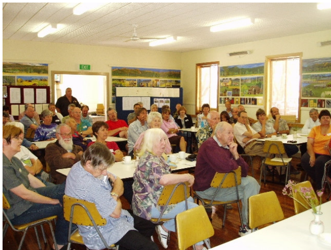
Community Workshop November 2006