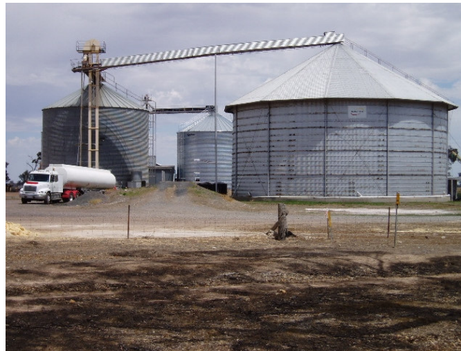
Laharum Grain Depot