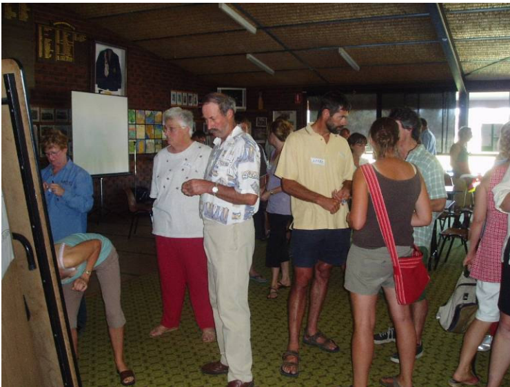
Casting a vote at the Community Workshop

The following points are the ideas that were identified at the community workshop – they have not been edited but represent a summary of ideas generated on the workshop day.