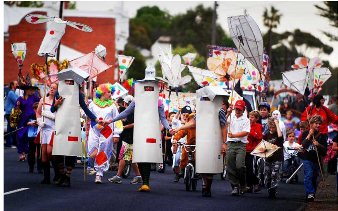
Nati Frinj Mardi Gras

It is commitment to action and progress that makes Natimuk a special place. The Community Plan confirms the commitment for the sustainability and the need for appropriate care, maintenance and growth of these important assets.