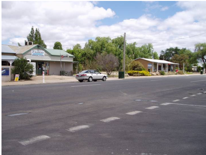
The Main Street of Natimuk