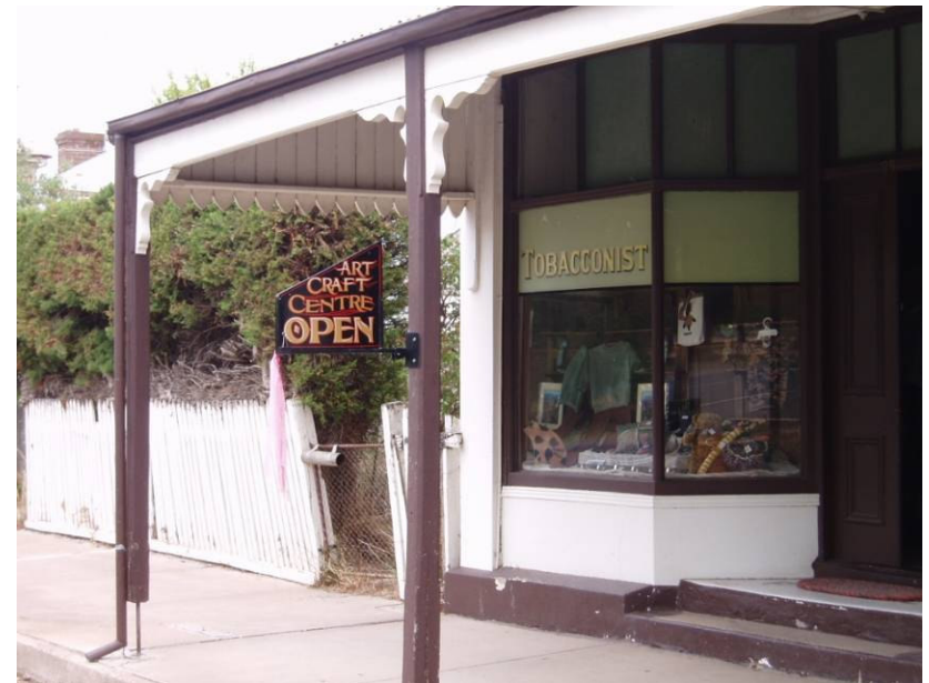
Arapiles Art and Craft Centre

Natimuk Preschool Natimuk Primary School Natimuk Rifle Club Natimuk RSL Natimuk Sailing Group (not so active at the moment!) Natimuk School Council Natimuk Senior Citizens Natimuk Showgrounds Management Committee Natimuk Soldiers Memorial Park Reserve Natimuk Sporting Club Natimuk Tennis Club Natimuk Urban Landcare Group Natimuk Youth Group - 4CNY