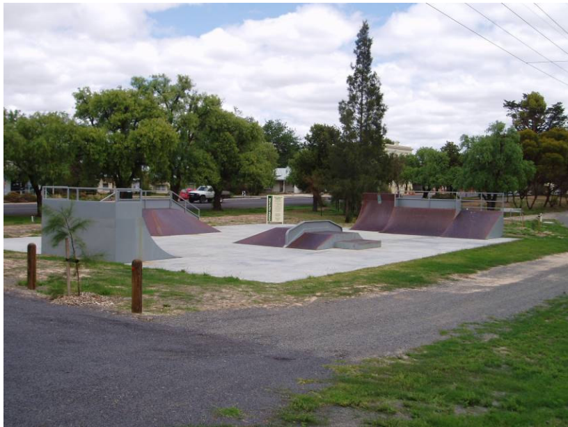
The Natimuk Skatepark

These improvements have all had a positive impact in the community.