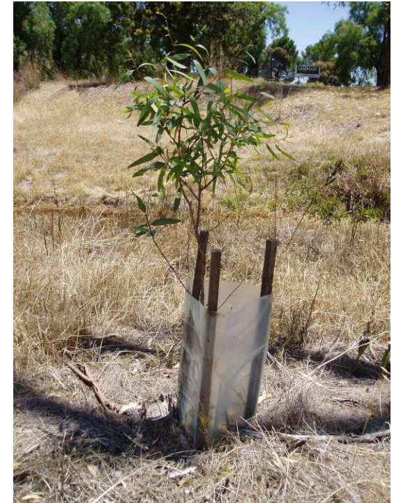
Revegetation along the Natimuk Creek

Following on from the workshop project teams have been formed on a number of these community priorities. The details of what will occur and what is hoped to be achieved is listed in the following table.