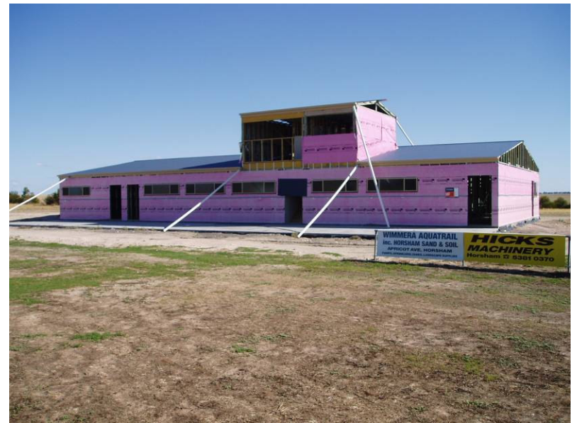
New Natimuk Football Changerooms (now completed)

As can be seen from this plan Natimuk is an active community with many ongoing projects and initiatives. The Community Building Initiative recognises the importance and the necessity of these activities to our community, many of which are listed as assets of the community that should be retained, supported and continue to flourish. Without these activities Natimuk would not be the place that it is.