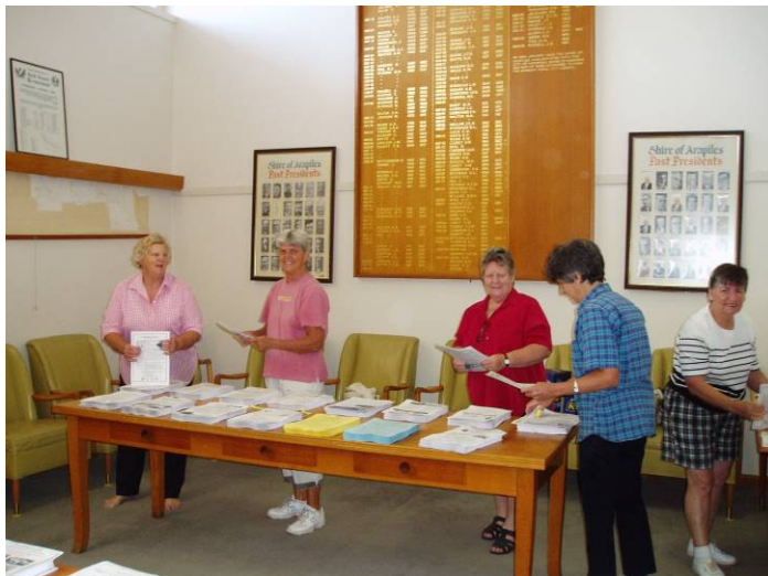
Natimuk & District Progress Association Assembling the Progress Press

Arapiles Art Craft Centre Arapiles Community Theatre Arapiles Historical Society Arapiles Rescue Group Arapiles Victorian Farmers Federation Boorang Country Womens Association Friends of Arapiles Friends and Relatives Group Grass Flat CFA Lions Club of Natimuk Masonic Lodge of Natimuk/Freemasons Mt Arapiles State Park Advisory Committee Natimuk Agricultural and Pastoral Society Natimuk and District Advisory Committee Natimuk and District Gymnastics Club Natimuk and District Progress Association - Progress Press Natimuk and District Soldiers Memorial Hall Committee