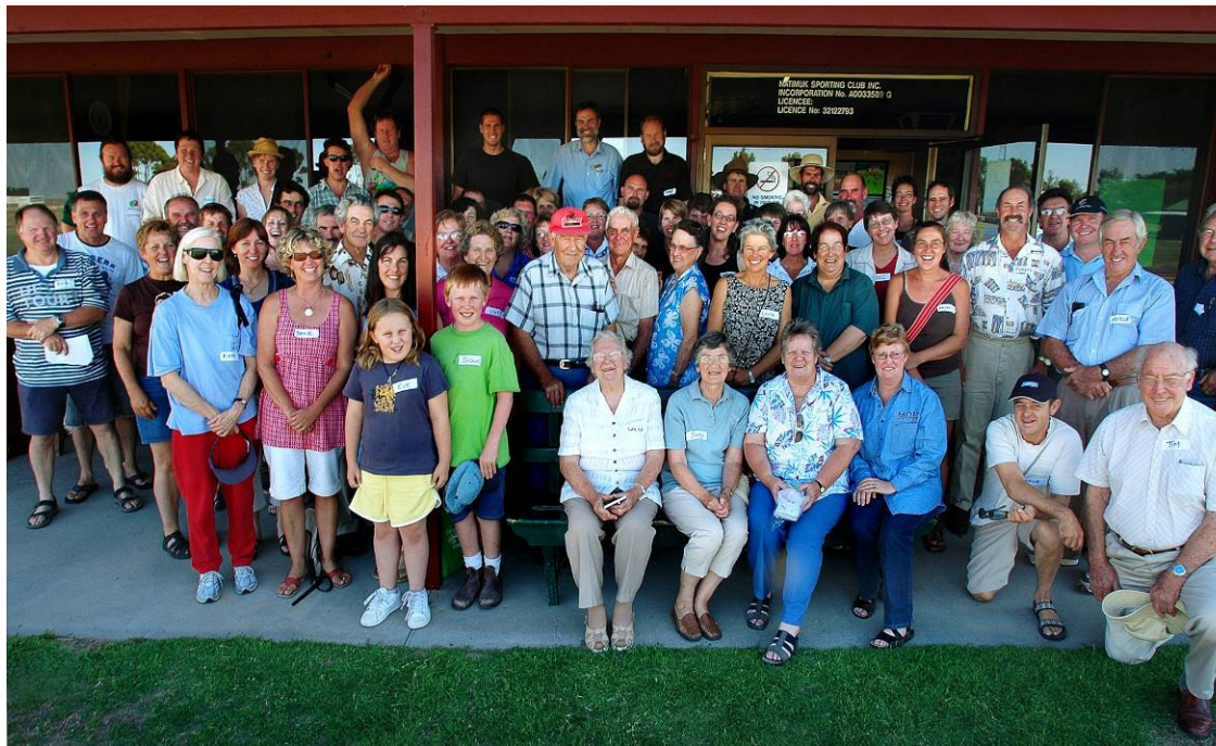
Community Workshop - February 2007