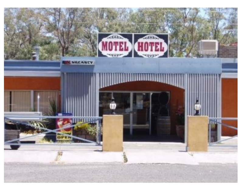
Dadswells Bridge Motel Hotel

through Dadswells Bridge. The reach of the Creek from Lake Lonsdale to the Western Highway varies in condition and is identified as a high priority waterway in the Wimmera Waterway Health Strategy (Wimmera CMA, 2006).