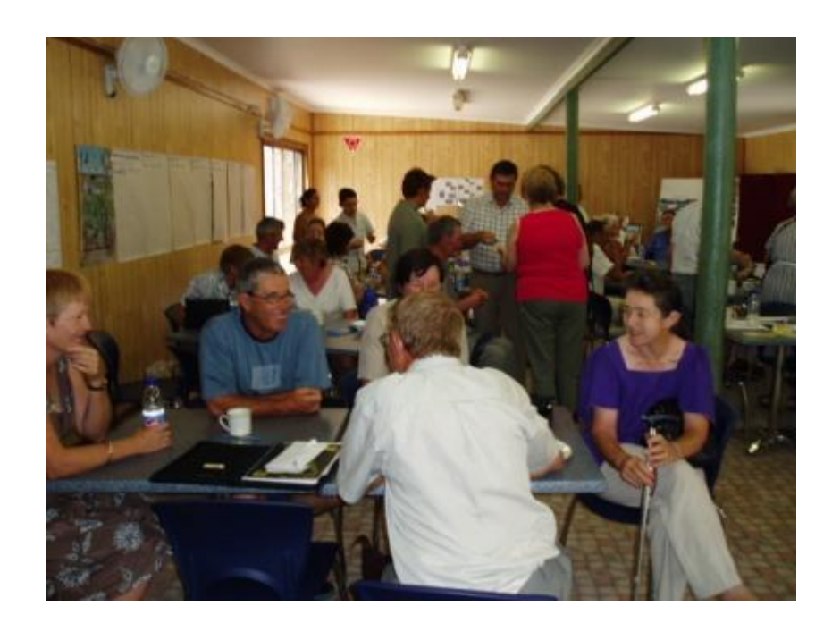
Community Workshop February 2007

This plan will guide actions for a period of time. It will be a living document and as actions are achieved, the plan will be reviewed to keep it live and relevant. New initiatives will be added to the plan during the review process and as the actions of this plan are successfully achieved. The plan will be reviewed by the Community Initiatives Group once a year. This group is under the auspice of the Dadswells Bridge Progress Association.