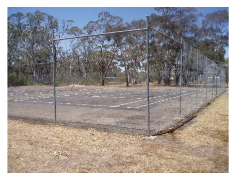
Dadswells Bridge Tennis Courts

The first tennis courts were established in 1926 adjacent to the Mt William Creek by the residents of Dadswells Bridge and surrounding area. After the Second World War the tennis courts were sealed and two new courts and sheds were constructed. Local dances were commonly held in the Hall to raise funds for the Tennis Club. The Tennis Club has provided the community of Dadswells Bridge not only a place for exercise and competition, but also a social place for the community to gather.