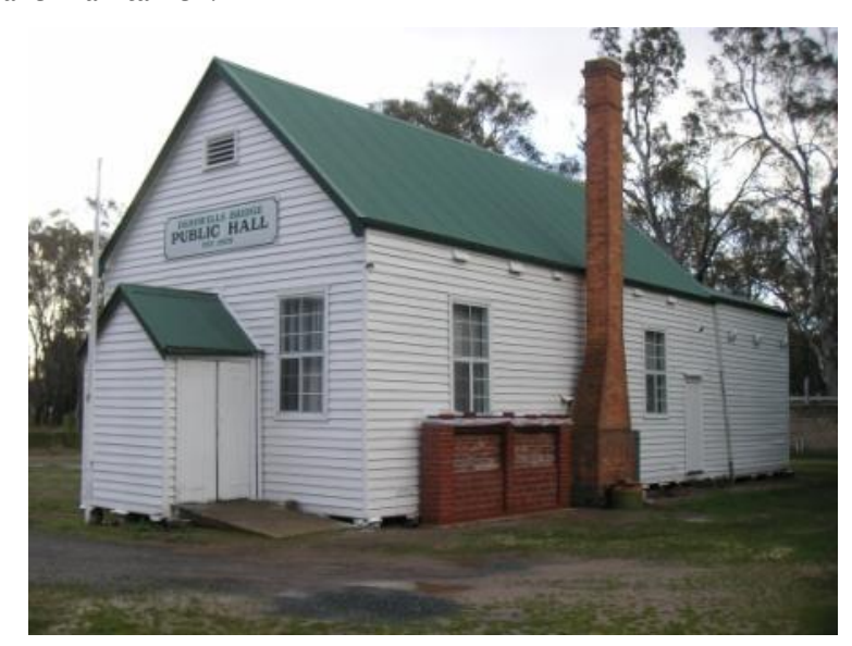
Dadswells Bridge Public Hall

In 1945 the Bush Fire Brigades were reorganised to become part of the Country Fire Authority, and the name then changed to Dadswells Bridge Rural Fire Brigade. The Brigade has come a long way since the days of fighting fires with beaters, rakes and shovels, knapsacks and hand operated pumps. Today's Brigade boasts a modern 4-wheel drive tanker with high capacity diesel pump, fog and foam sprays. This tanker is supported by a community owned tanker and quick fill pump. All community members are encouraged to join and take their part in the crucial role the Fire Brigade plays in this area, and in the broader community. Membership involves regular training to ensure qualification and fire fighting skills are maintained.