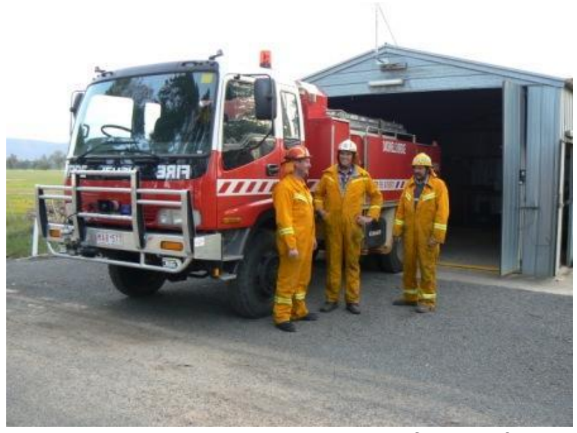
Dadswells Bridge Brigade