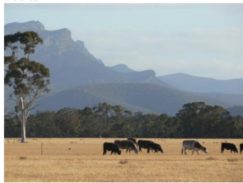
View of Roses Gab

The plan will be used by the Dadswells Bridge Progress Association and other community groups to provide a basis for action and to give an indication of community priorities for the area.