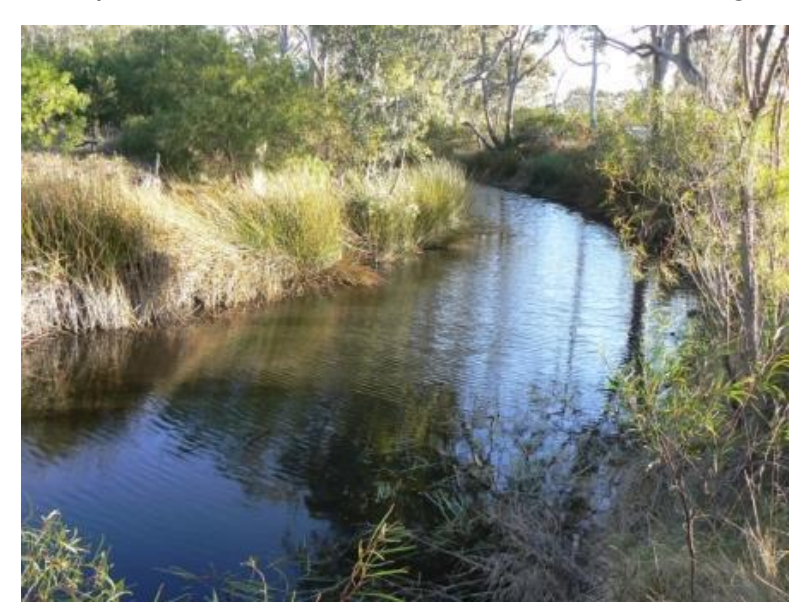
Mt William Creek

The Mt William Creek winds its way through Dadswells Bridge providing not only a valuable water source for the town, but also an environmental and recreational feature. Mt William Creek starts in the Mt William Range of the Grampians and enters the Wimmera River after flowing