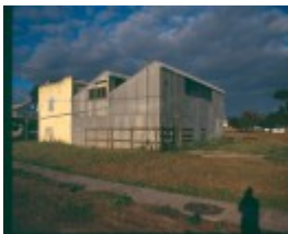
Wimmera Stock Bazaar Southwest December 2001