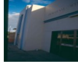
H01985 wimmera stock bazaar front detail dec01