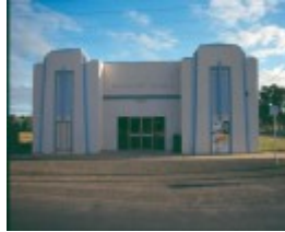
H01985 wimmera stock bazaar front dec01