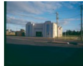
H01985 wimmera stock bazaar north dec01