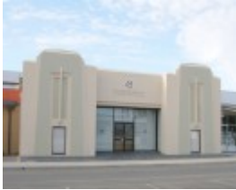
FORMER WIMMERA STOCK BAZAAR SOHE 2008