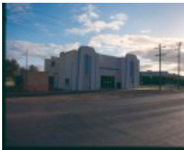
H01985 wimmera stock bazaar northeast dec01