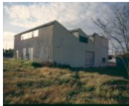
H01985 wimmera stock bazaar southeast dec01