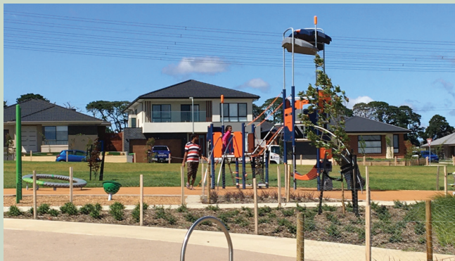
Houses fronting local park in Clyde North, City of Casey