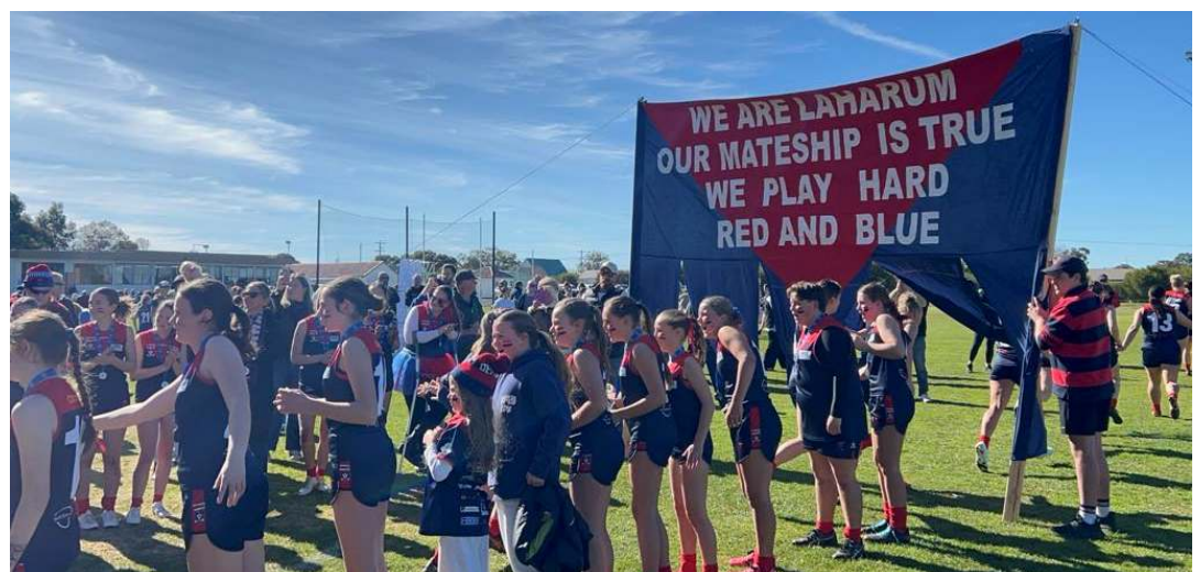
Laharum Girls team supporting the banner run through the Women's side