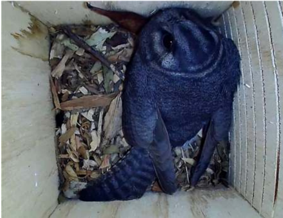
An Australian Owlet-nightjar in one of Laharum Landcare's nest box