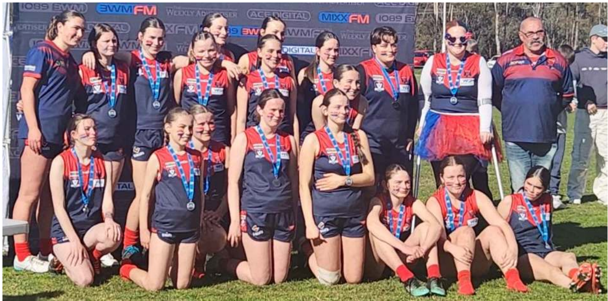
Laharum Girls Football team with their runner-up medals