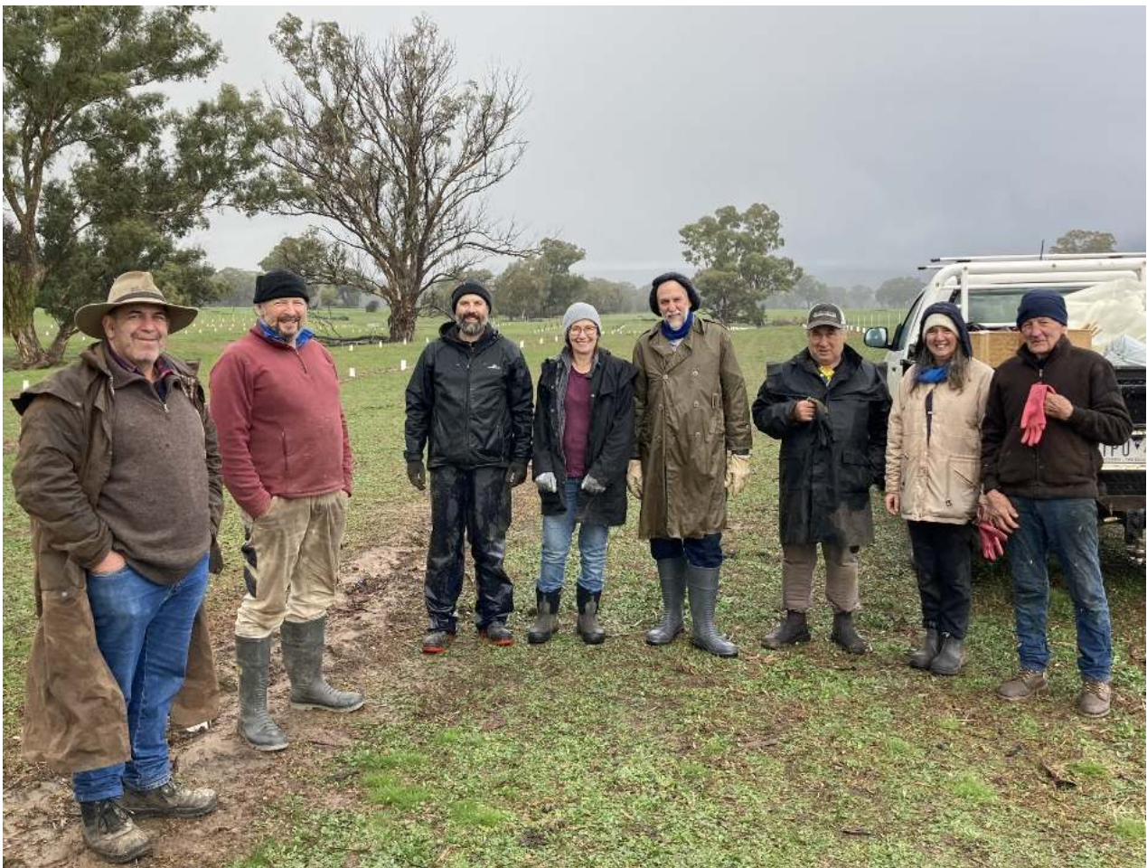
Helpers at the plantout on Saturday July 26