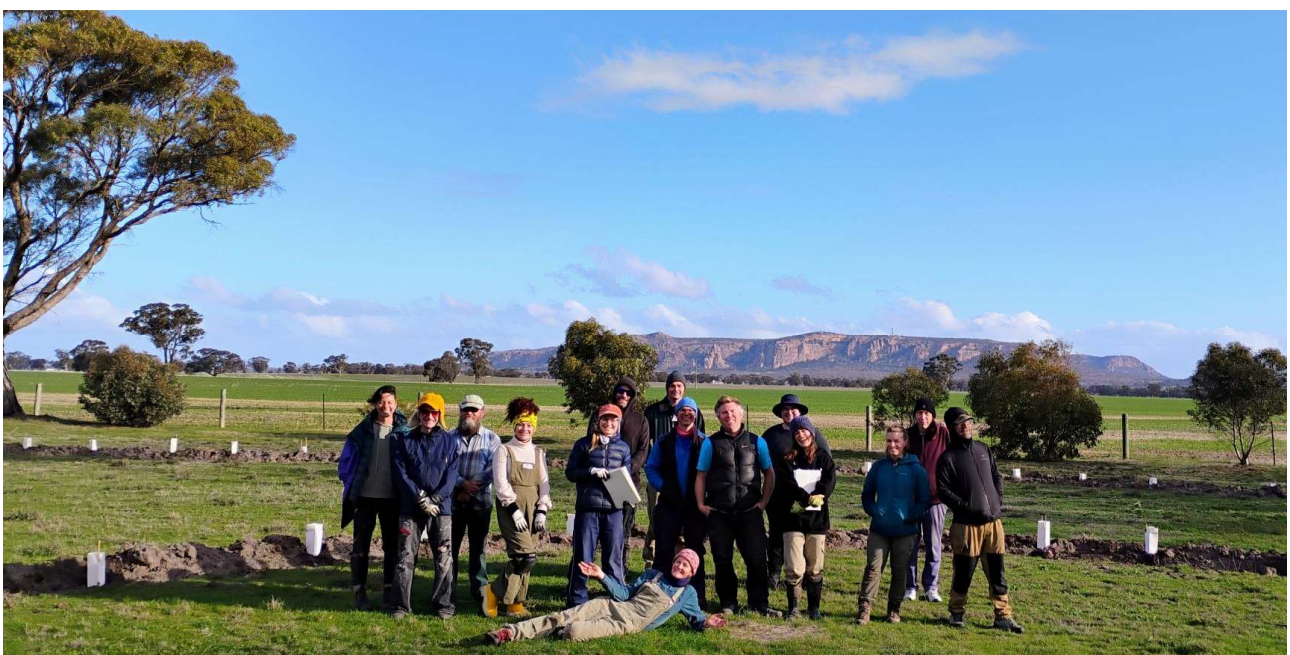
Volunteers after a successful planting during Saturday/Sunday July 19-20 at Arapiles