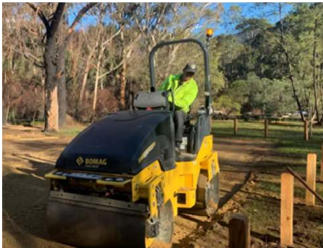
Borough Huts Fire Recovery work