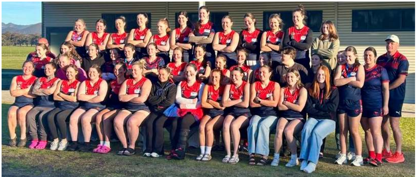
Joint team photo of Laharum girls and women's football side taken after the Grand Final