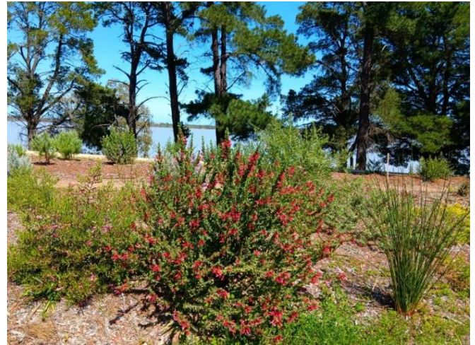
Native plant flowering in the garden at Green Lake