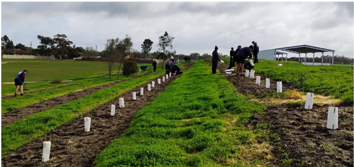
Horsham College students helping revegetate the Foundry