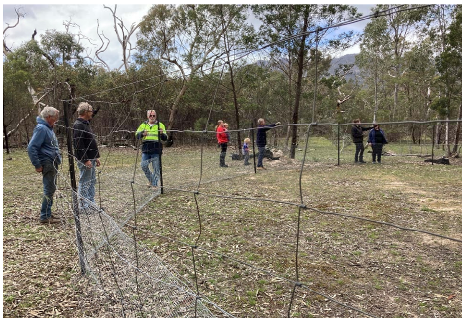
Installing an 'exclusion plot' to exclude macropods, deer and rabbits