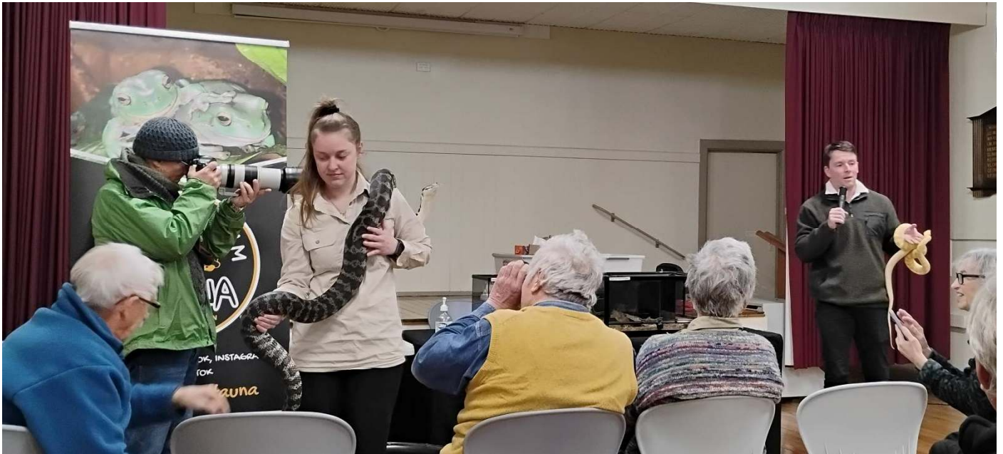
'Fair Dinkum Fauna' showing native wildlife at Laharum Hall