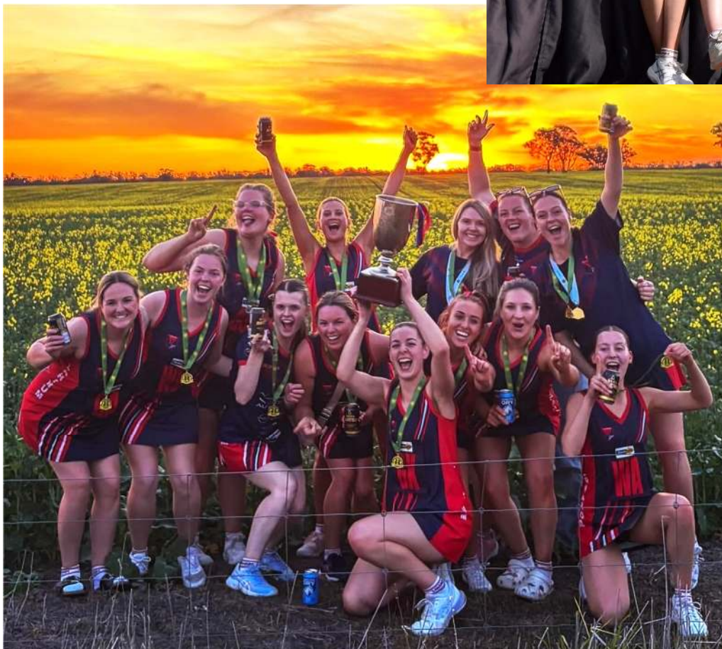
Winners Laharum C Reserve team ↑