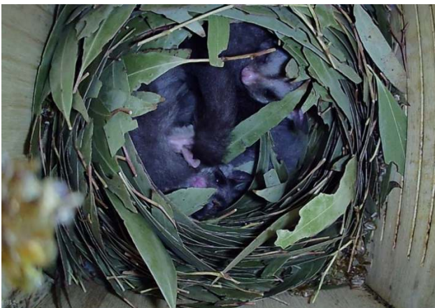
Sugar Gliders found in one of Laharum Landcare nest boxes using the telescopic arm