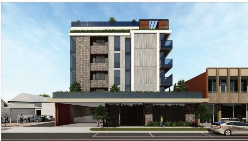
03 NORTH VIEW N16

Progress is also being made across strategic planning including the Smart Planning Reform, Horsham South Structure Plan and Horsham Flood Amendment to ensure the long term growth of the municipality.