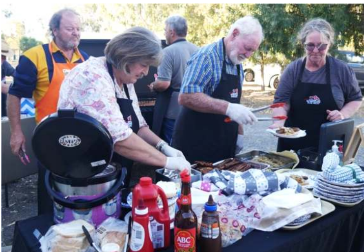
North West Grampians Lions Club cooking the barbecue prior to the Small Halls event

Invite your partner, friend, family and neighbour