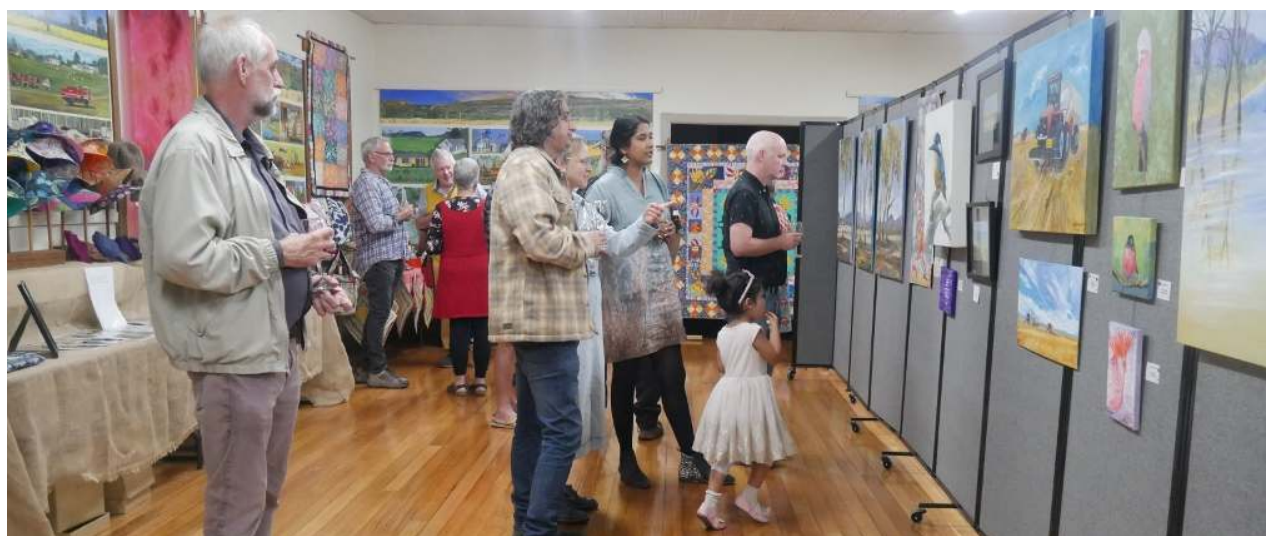
Opening Night of Gariwerd Local Artists Exhibition