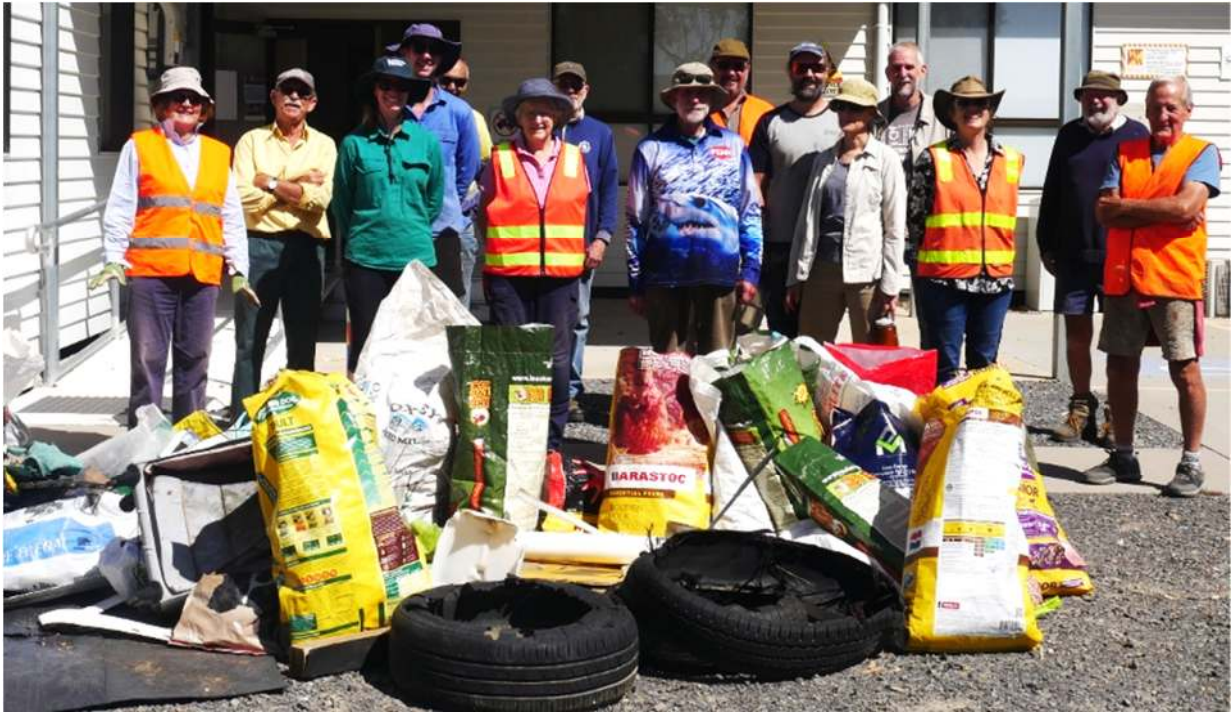
Clean Up 'Laharum Wartook' Day on March 3