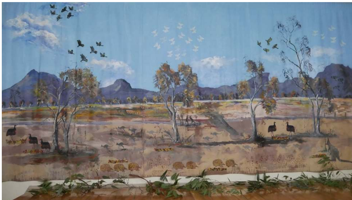
Backdrop painted by Gariwerd Local Artists for their exhibition at Laharum Hall