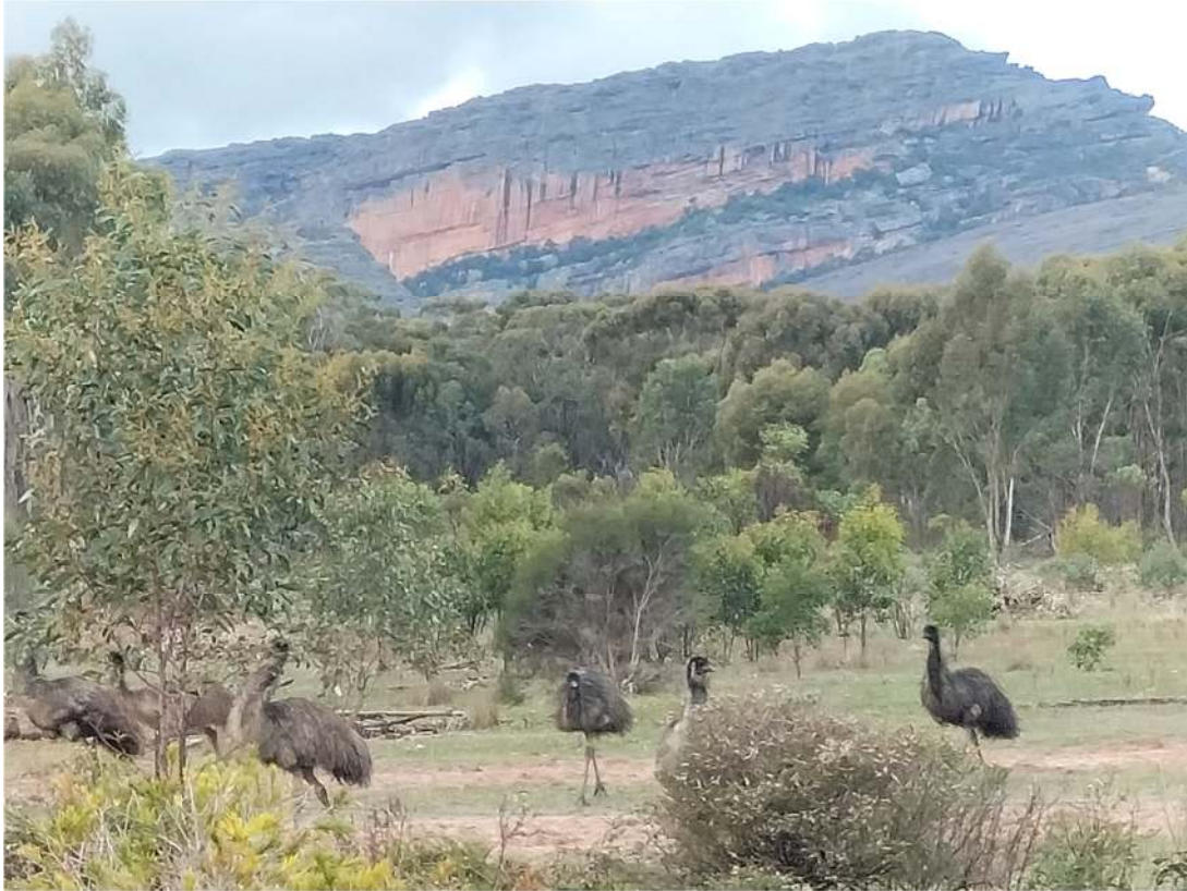
Visitors passing by to see what's over the fence with Mount Stapylton in the background

Although there's one more month of winter, there's signs of warmer spring weather to come.