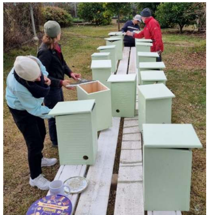
Painting 2 nd coat on the nest boxes Monday July 1