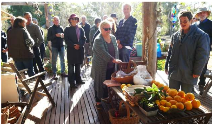
Laharum Wartook Veggie Swap in June

Singing ability definitely not necessary