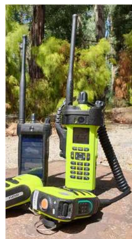
New CFA radios

E: info@havenalpacas.com.au W: www.havenalpacas.com.au