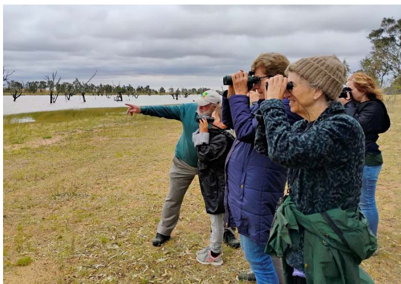
Attendees watching Brolgas at Taylors Lake