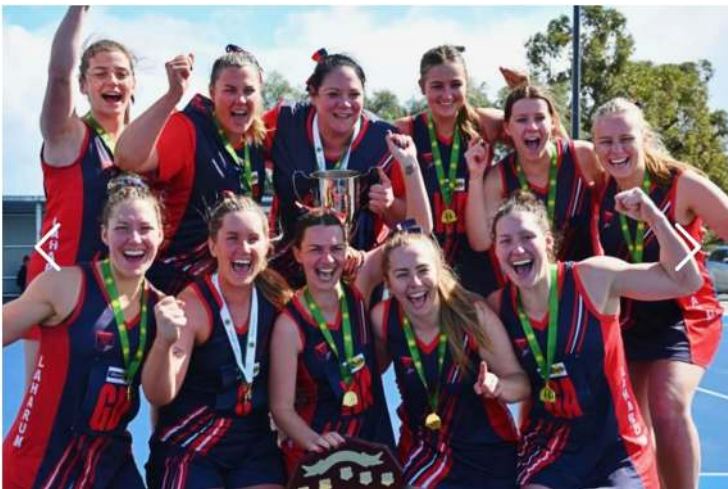
Laharum A Grade Netball defeated Rupanyup