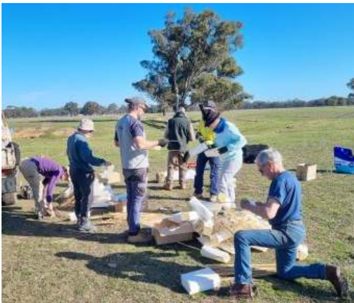
Preparing covers to protect plants at Griffith's property on Sunday August 11