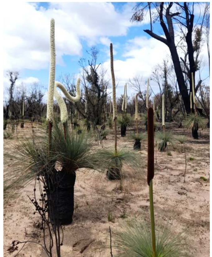
Stunning grass trees after Dadswells Bridge fire