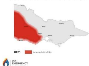
Bushfire Outlook Spring 2024 Increased risk of fire in the far west and southwest parts of Victoria

if tankers or private units are working in the drop zone for safety reasons. This can potentially impact the strategic operations of controlling the fire.