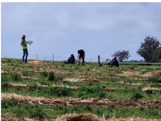
Plant out with student groups near Green Lake early September