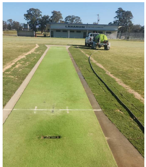
Laharum cricket pitch after removal of mound