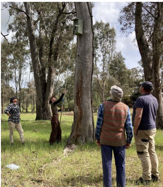
Anna Senior from Connecting Country demonstrates the use of a nest box inspection camera after giving a talk about monitoring nest boxes