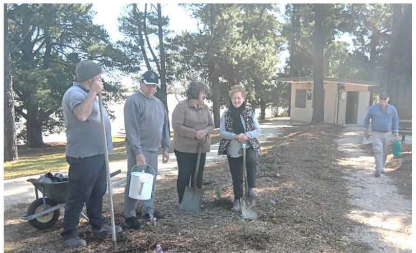
Sensory Garden plant out at Green Lake on September 18