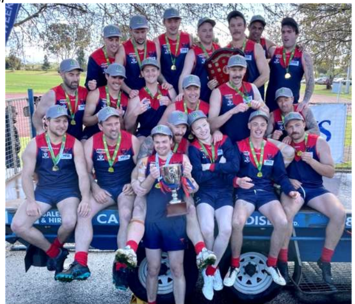
Laharum Reserves defeated Swifts