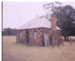
fulham balmoral horsham rd kanagulk overseer's cottage nov1994