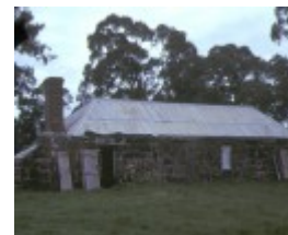
fulham balmoral horsham road kanagulk shearers shed nov1980