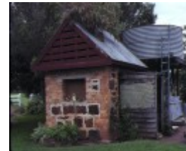
fulham balmoral horsham rd kanagulk meat house nov1980