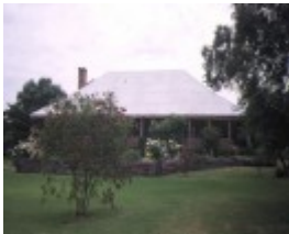
1 fulham balmoral horsham rd kanagulk front view homestead nov1994