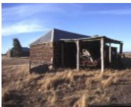
fulham balmoral horsham rd kanagulk woolshed complex feb1980