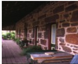
fulham balmoral horsham rd kanagulk front verandah nov1994