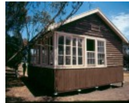
h02051 1 natimuk primary pavilion