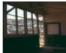
h02051 natimuk primary pavilion interior2