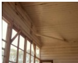
h02051 natimuk primary pavilion interior