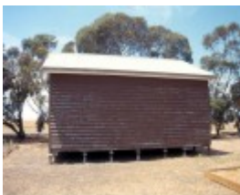
h02051 natimuk primary pavilion