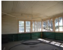
PAVILION CLASSROOM SOHE 2008