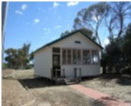
PAVILION CLASSROOM SOHE 2008