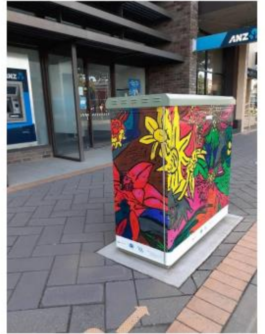
Location: 71 Firebrace St Map Link: CLICK HERE